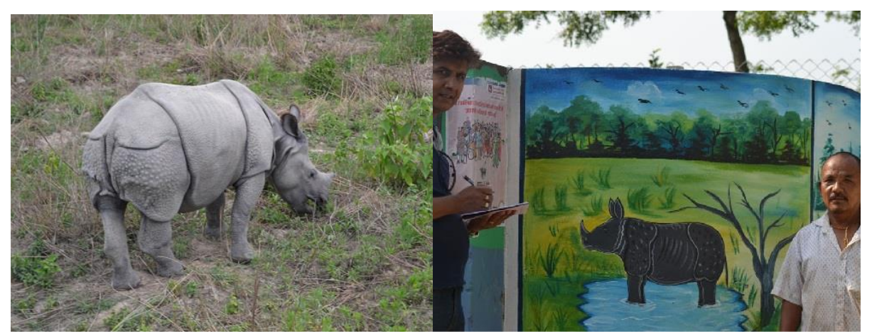
Left: Rhino during field visit. Right: Consultation with local people.