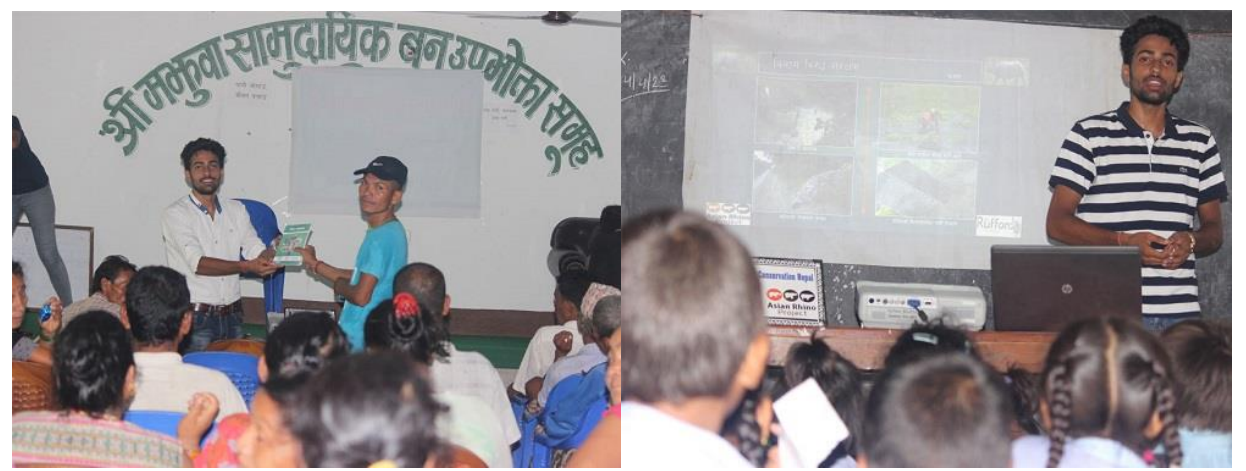
Left: Rhino Conservation Educational toolkit Distribution and Community interaction. Right: Teaching programme.