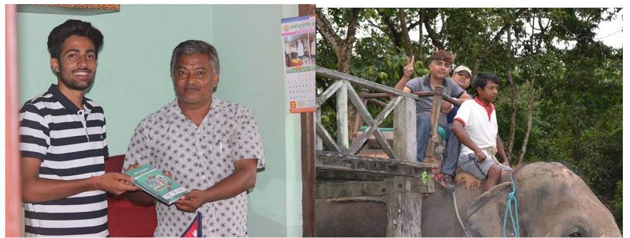
Left: Rhino Conservation Educational toolkit Distribution. Right: Elephant riding inside CNP