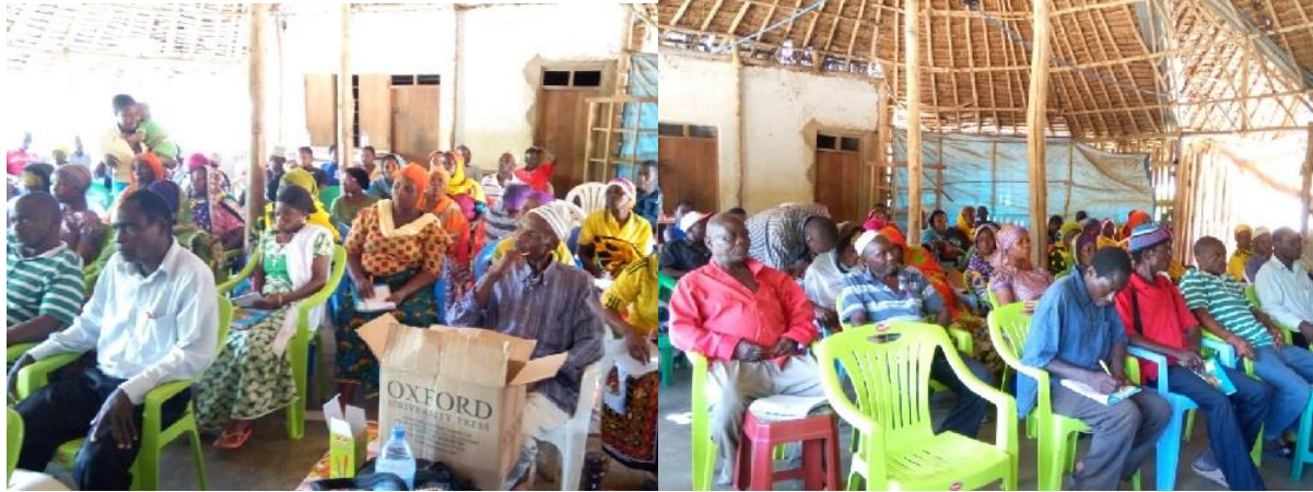
Participants following up during the training