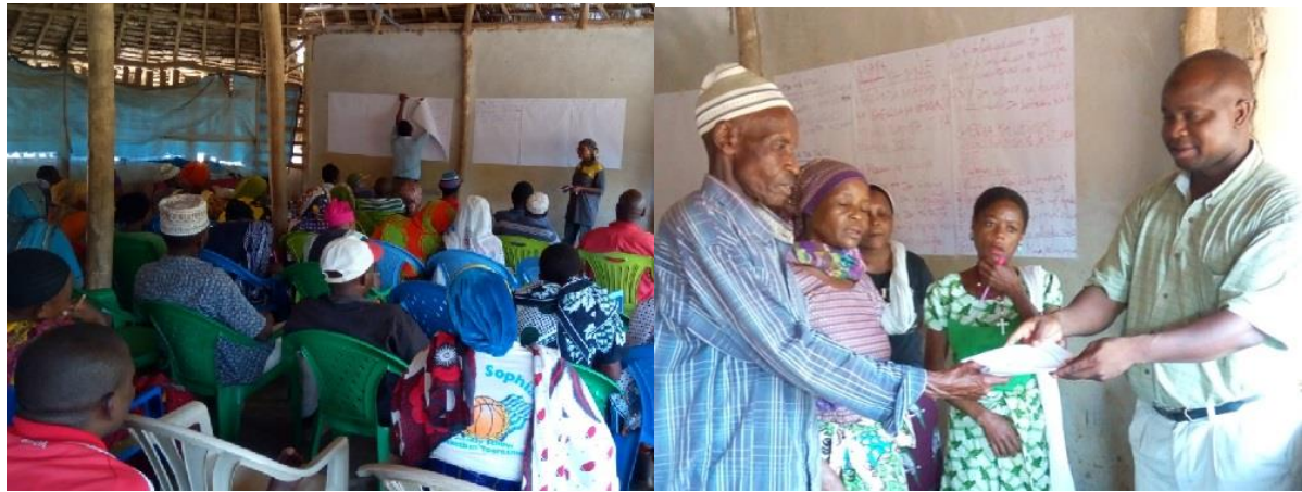
Left: Beekeeping Officer giving training to beekeeping group members. Right: District Natural Resources Office handing over reference materials to the trainees.