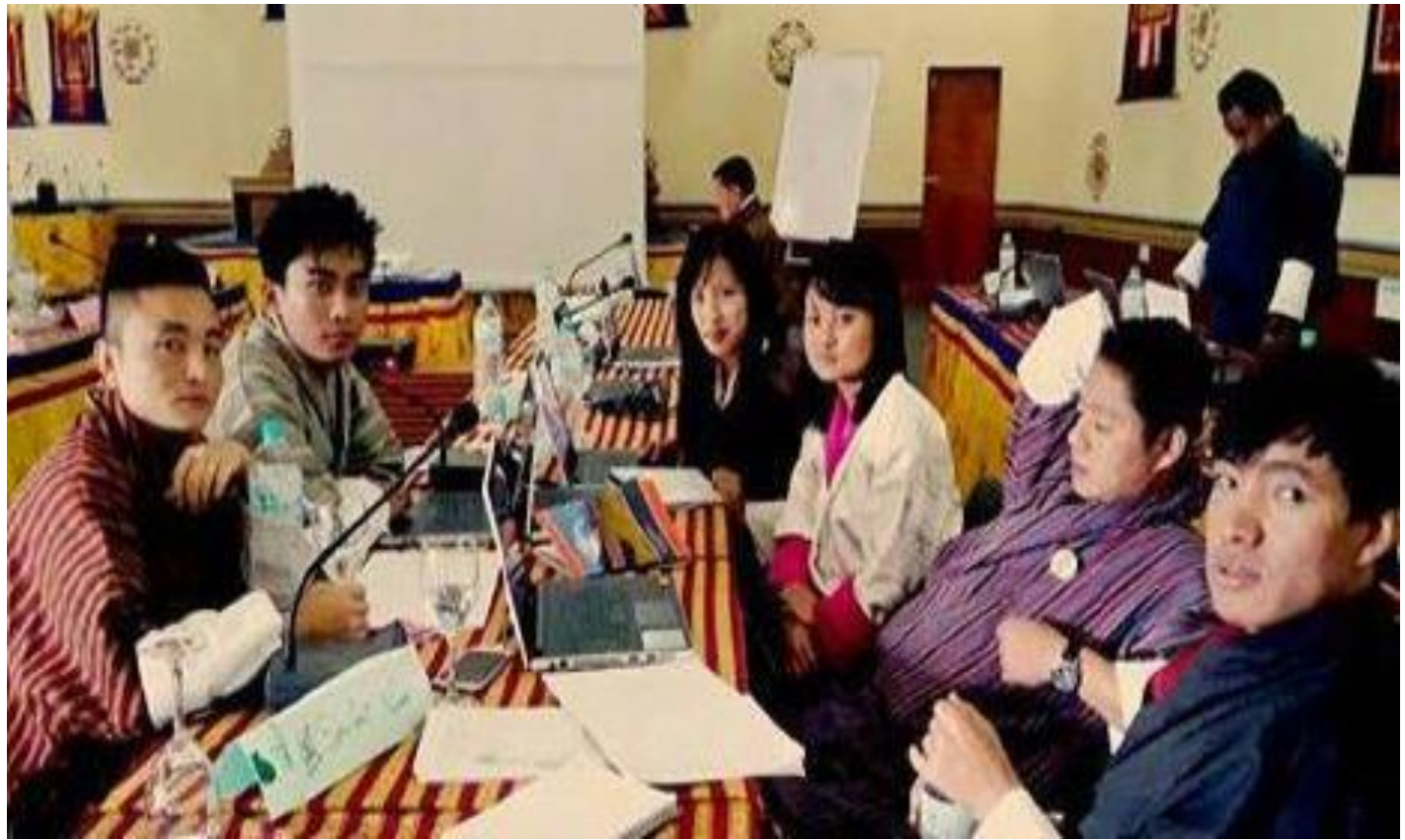
Figure 3: Interaction with fellow researchers and students

The team has also informed the forestry official in that park area to strictly monitor and manage the waste properly to conserve and manage environment and ultimately to conserve cave biodiversity. Therefore our research team has carried out focus group discussions with the local leaders to prevent such conservation threats as far as possible through incorporating conservation actions in strategic Local Area Plan in future.