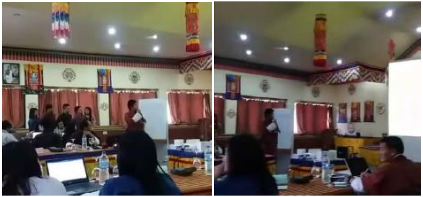
Figure 2: Presentation on Conservation Importance of Cave Biodiversity made during meeting with the students and other officials.

The study recorded several threats and disturbances created by the local community of Khoma. The waste disposal in the habitat area were prominent in most of the locations.