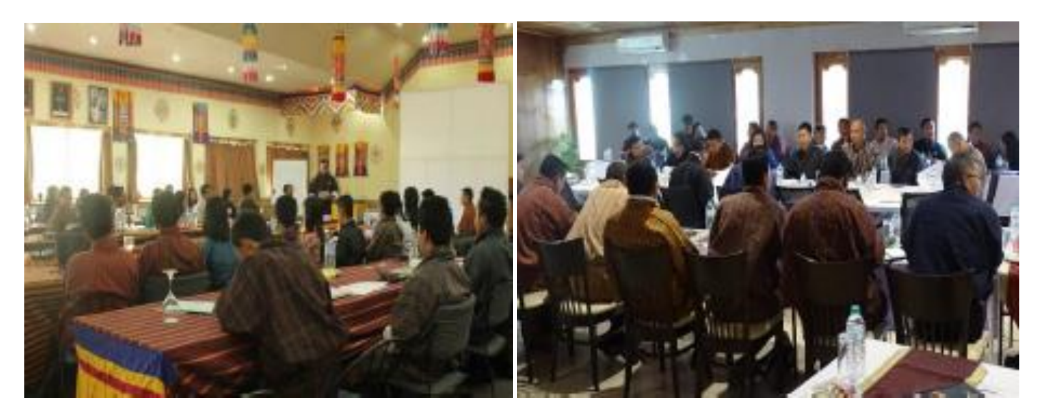
Figure 4: (Left) Outreach and education meeting with the BSc. Environment and other interested students. (Right) Outreach and education meeting held in Khoma Gewog involving local leaders, school teachers and other officials present in the Gewog

The conservation awareness was also targeted in two selected educational institution in the country i.e. Lhuentse Higher Secondary School and Khoma Lower Secondary School. The awareness and consultative meeting were also conducted with the students of BSc Environmental Studies and Climate Change and BSc Sutainable Development of the College of Natural Resources. This meeting was principally aimed at publicizing the few documented invertebrate assemblage in the caves of Khoma along with their habitat conditions.