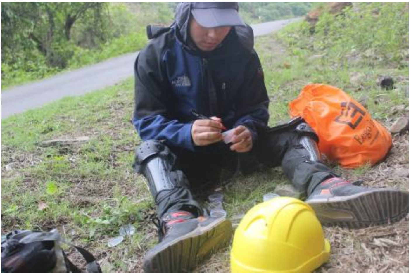
Figure 1: Field assistant labeling specimens collected during the field data collection.

Cave invertebrates were assessed in various habitat types (various vegetation types, gorges, valleys, open streams, settlements, forest clearings and trails). The project team was successful in discovering diversity of cave invertebrates in Bhutan. In the long run, the team has been able to document the composition of the cave invertebrate assemblage in the caves of Khoma along with their habitat conditions.