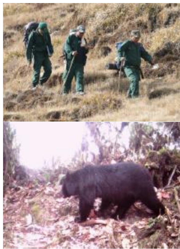
Left: Monitoring the camera trap. Top right: In the field. Bottom right: Residential bear one.

The second phase of camera trapping exercise is still going on within the study area to monitor the movement and presence of bears.