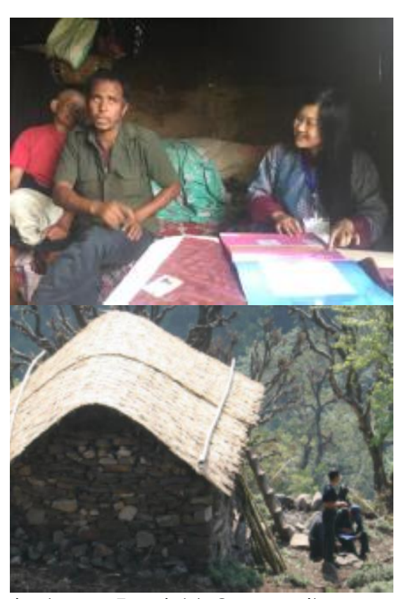
Left: Surveying the community within the project area. Top right: Community survey. Bottom right: Surveying the local herder within the project site.

The local community and school students are made aware regarding the Himalayan black bear. The awareness were being carried out by trained and influential local leaders and forest officer within the study area.