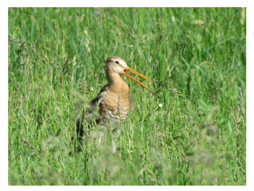
Black-tailed Godwit on breeding grounds, Polissia region.

In May and June 2018, we continued field work aimed to find new breeding locations and to conduct counts of grassland waders in Polissia nature zone of Ukraine. This time more attention was paid to central and eastern parts of the region. In parallel monitoring, counts were done on some stable locations in Volynian Polissia known since 1980s. Detailed analysis of the distribution and numbers change of waders in north Ukraine will be finished soon and published in a separate paper which is in preparation now. As a preliminary result, we can conclude now that population of lapwing, common redshank, and black-tailed godwit have decreased in >2.1, 1.4, and 3.3 times respectively since 1980s if taking into account only pair numbers on monitoring plots. We assume that real population decline is more severe, because of total extinction of many small breeding colonies or solitary breeding pairs in suboptimal habitats, especially in the case of Lapwing.