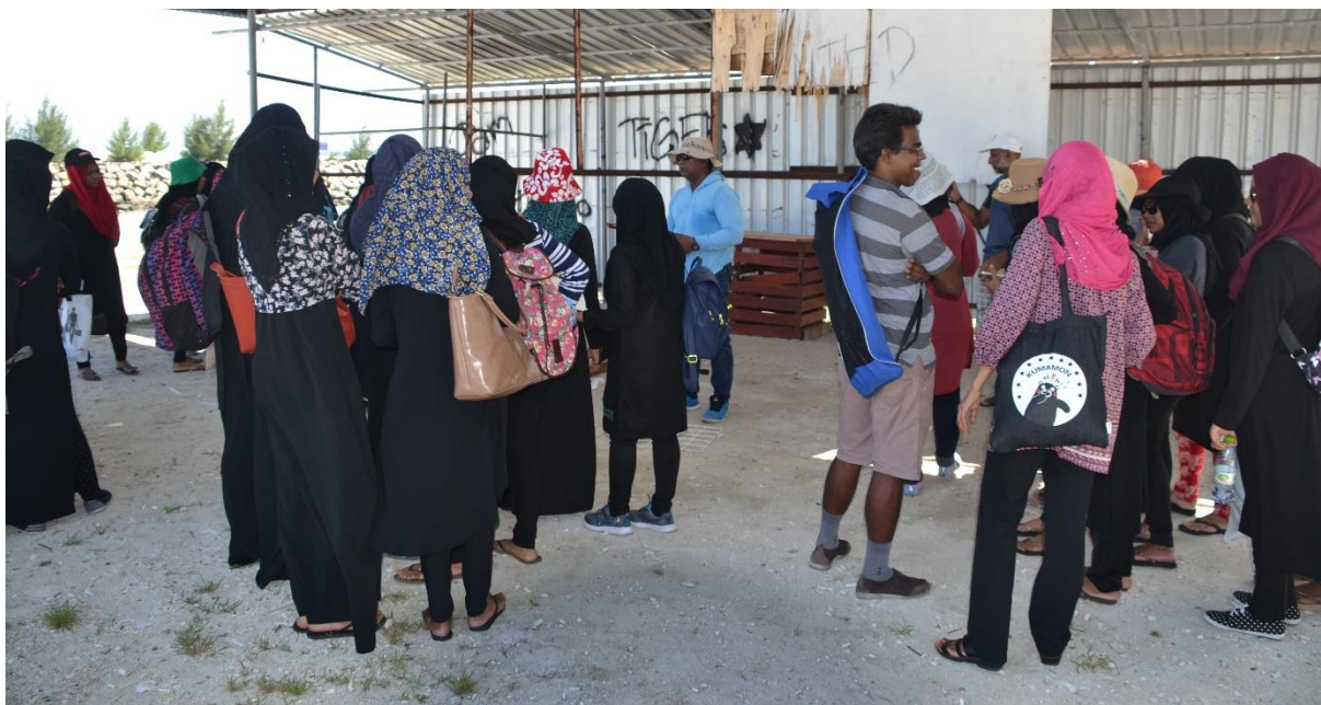
Students assembling for the activities