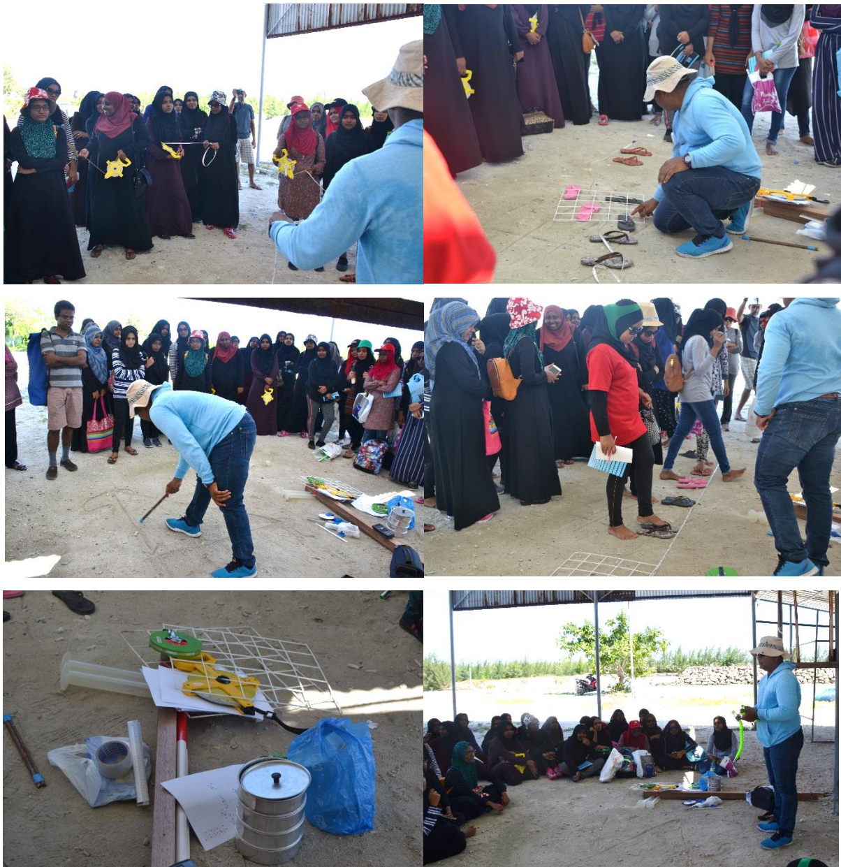
Students learning about proper use of snorkeling equipment and other tools used for data collection

This activity began with an introduction to the snorkeling equipment. Students were briefed on the proper use and care for snorkeling equipment and how to select the equipment when purchasing and burrowing it. Students were also briefed about the threats they could face while swimming on the reef and exploring it. In addition students were provided information on the use of quadrat, laying a line transect and using a clinometer to take measurement on heights of trees. They were also taught how to use the different scales on a measuring tape.