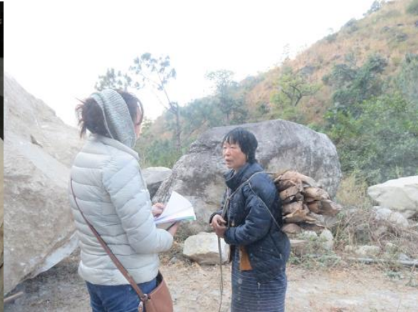
Left: Interview with local residents at Jara Village, Punakha. Right: Zawa village, Wangdue.