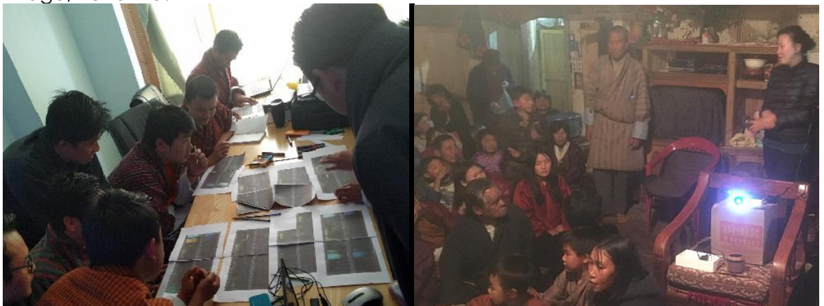
Left: Exploring the acoustic patterns to search for heron calls in months of data with local participants. Right: Focus group discussion during a community gathering using audio-visual clips of the target species.