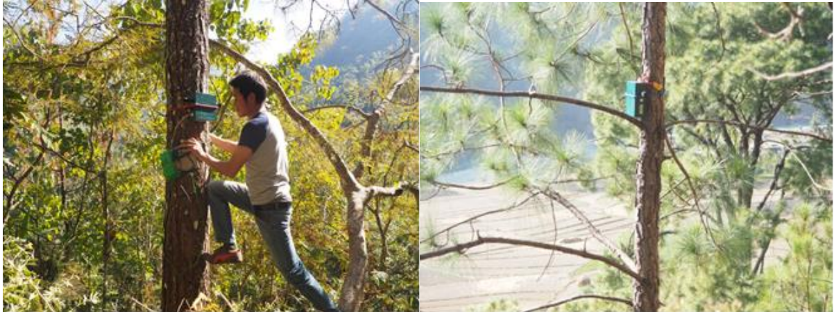
Left: Wildlife Acoustics Recorder deployment at the Nesting site of White-bellied Heron at Tingtibi. Right: Acoustic recorder deployed at a known roosting site in Jara village, Punakha.

Sensor deployment discussions, in-the field training and focus group discussions on deployment sites