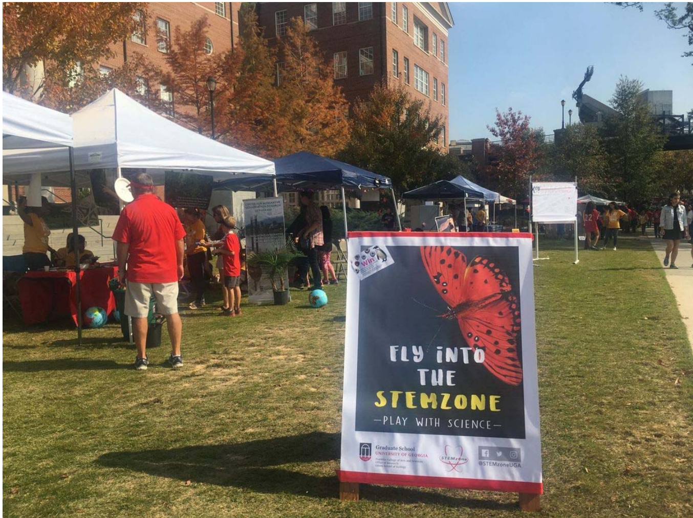
The STEMzone tailgate displayed 12 different science exhibits to Georgia fans before the game against South Carolina on Nov. 4.