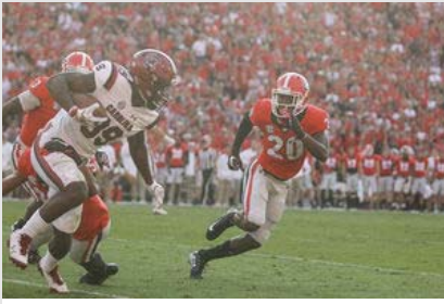
Pass defense gives up big plays to South Carolina