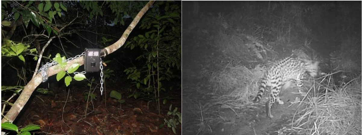
Left: camera trap installed. Right: Register of trap camera - Leopardus pardalis

We concluded half of our fieldwork activities collecting small mammals and we also used trap cameras to sample meso-carnivores in five forest fragments. I am sending you some pictures of these activities.