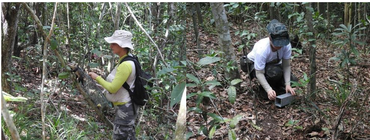
Release of Individuals