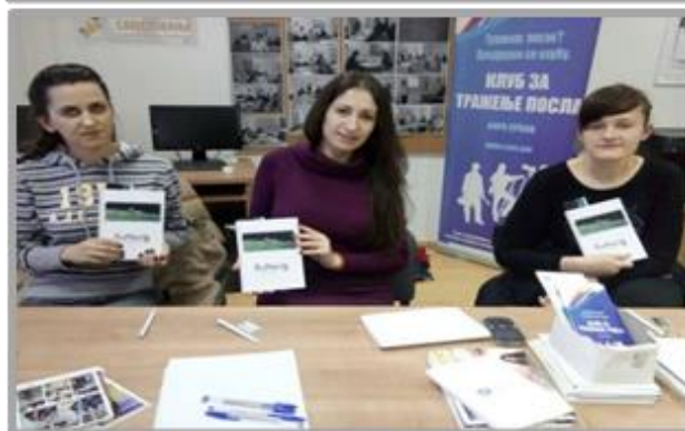
Right: Some of the participants in the Club for the employment of young people (during the lecture)