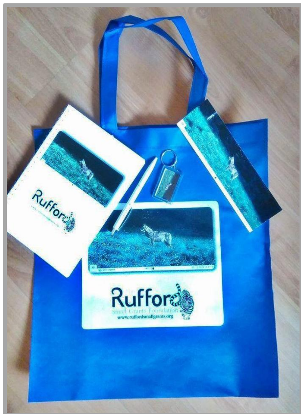
Left: Brochures and promotional material.