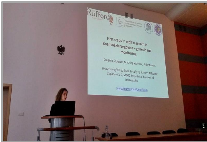
Mammal Research Institute, Polish Academy of Sciences, Poland. A lecture "First steps in wolf research in Bosnia and Herzegovina. Genetics and monitoring of the population"