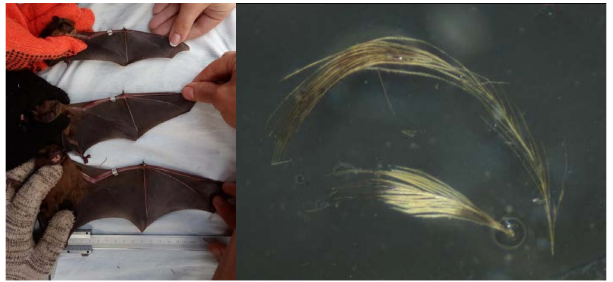
Left: Comparison of three Noctule species, from top to down: N. leisleri, N. noctula and N. lasiopterus. Dergachy forest. August, Kharkiv region. Right: Remains of feathers in faeces of GN from Dergachy forest, Kharkiv region. X20.