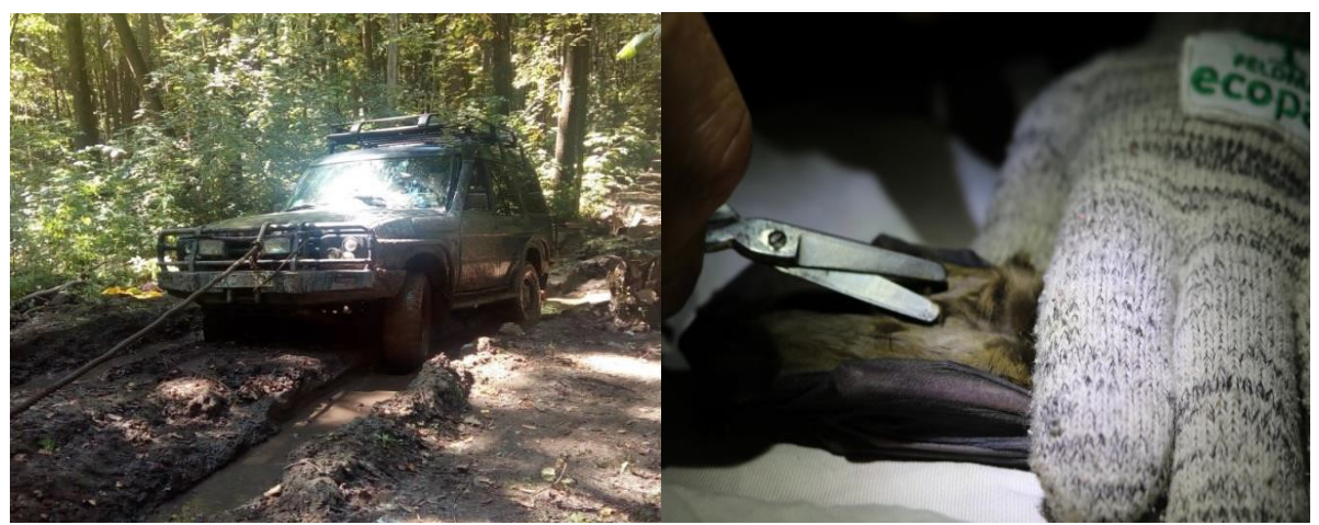
Left: Morning decision. August, Dergachy forest, Kharkiv region. Right: Cutting fur from GN captured in Dergachy forest, August, Kharkiv region.