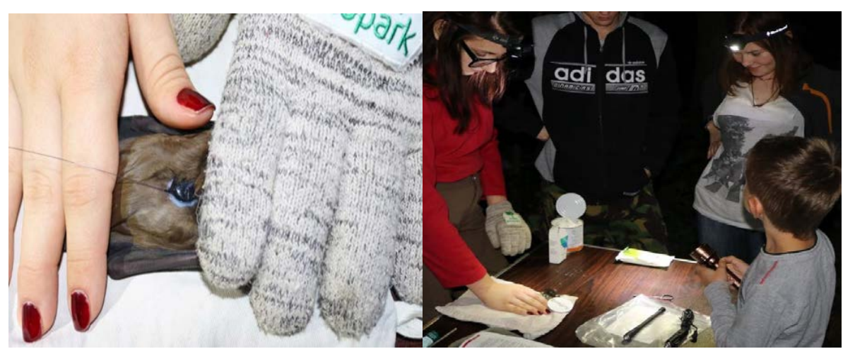
Left: Gluing the radio- telemetry tag on GN in Dergachy forest, August, Kharkiv region. Right: Gluing the radio- telemetry tag on GN in Dergachy forest, August, Kharkiv region.