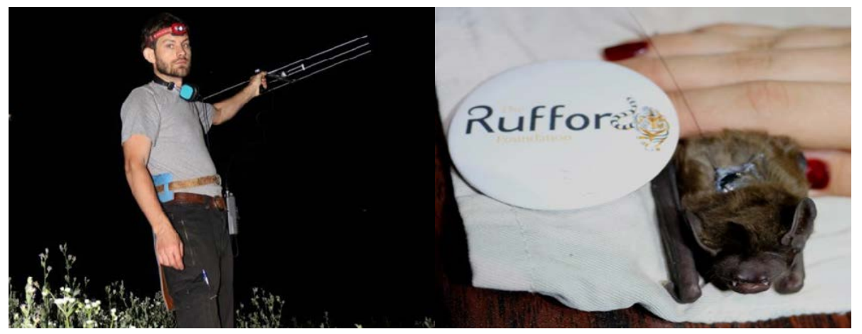
Left: Ratio-telemetry of GN in Dergachy forest the first steps. August, Kharkiv region.