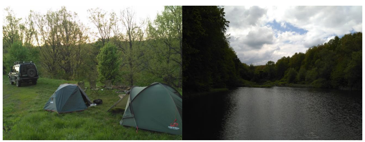
Left: May 2017, first expedition to Dergachy forest, Kharkiv region. Right: Main mist-netting lake - May, Dergachy forest, Kharkiv region.