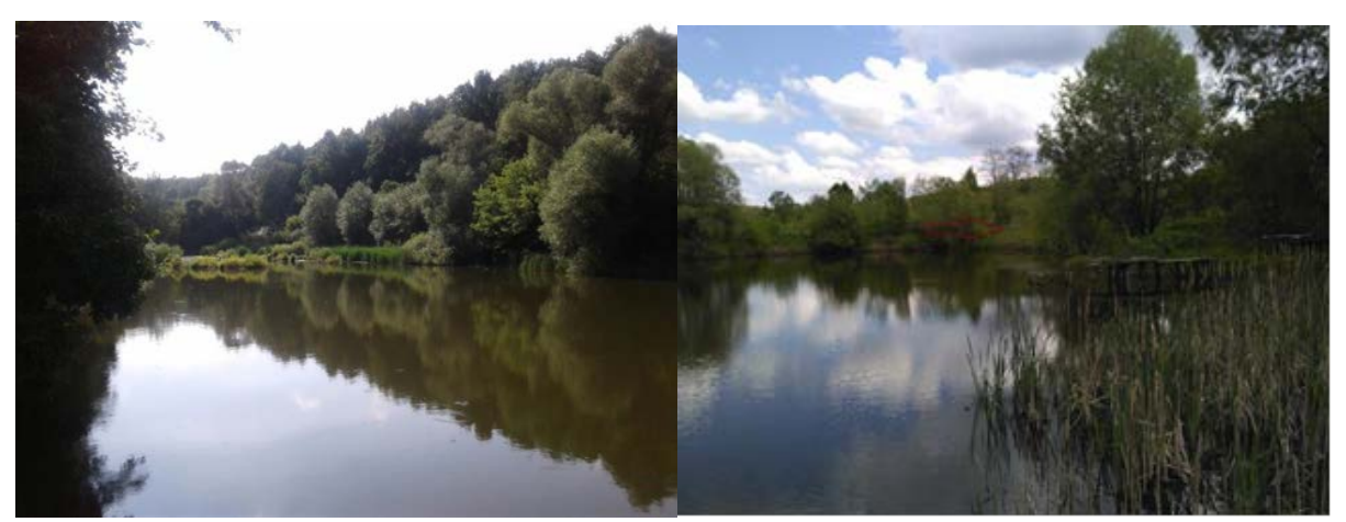
Left: Main mist-netting lake - August, Dergachy forest, Kharkiv region. ©Victor Kovalov. Right: Main mist-netting lake - May, Dergachy forest, Kharkiv region. The red arrow pointed the location of mist-nets operation. ©Victor Kovalov.