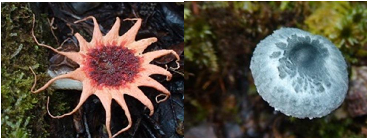
Left: An Aseroe at Bekaraoka forest. Right: Macrofungi of Bekaraoka forest.

We have started also, our conservation training about IUCN Red List assessment with the environment students of the IFT Environment Department and continue our school visits.