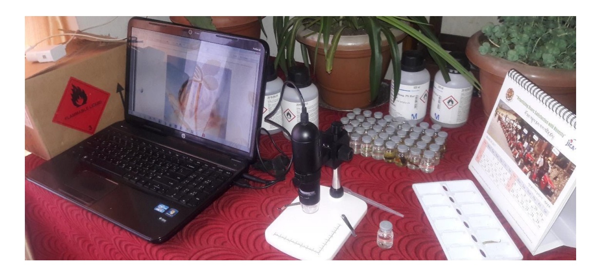
Fig. 3: Identification and taking picture using digital microscope