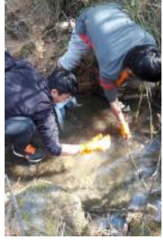
Fig. 5: (A) View of Woochu Stream; (B) Field assistants collecting sample