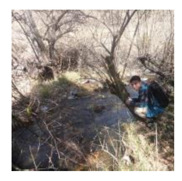
Fig. 4: (A) Recording chemical variables of the stream; (B) Recording Geographical Coordinates