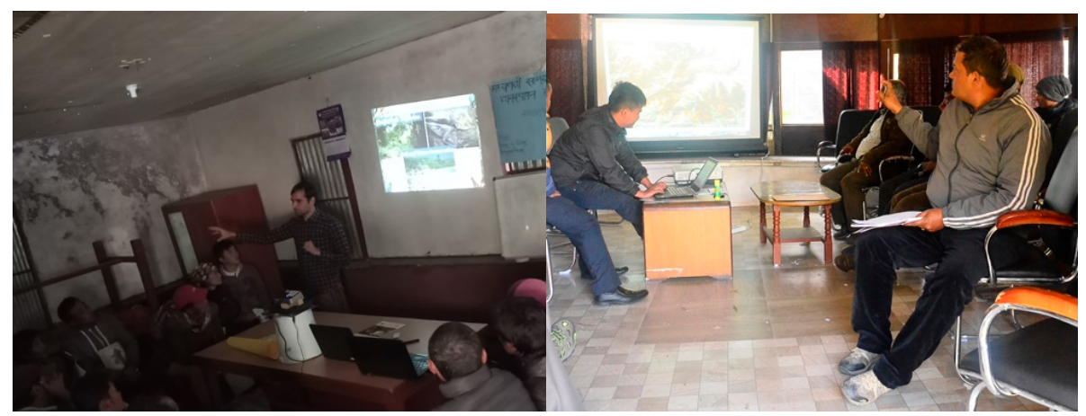
Left: Musk deer conservation training to Buffer zone user committee. Right: Musk deer workshop with National Park officials.