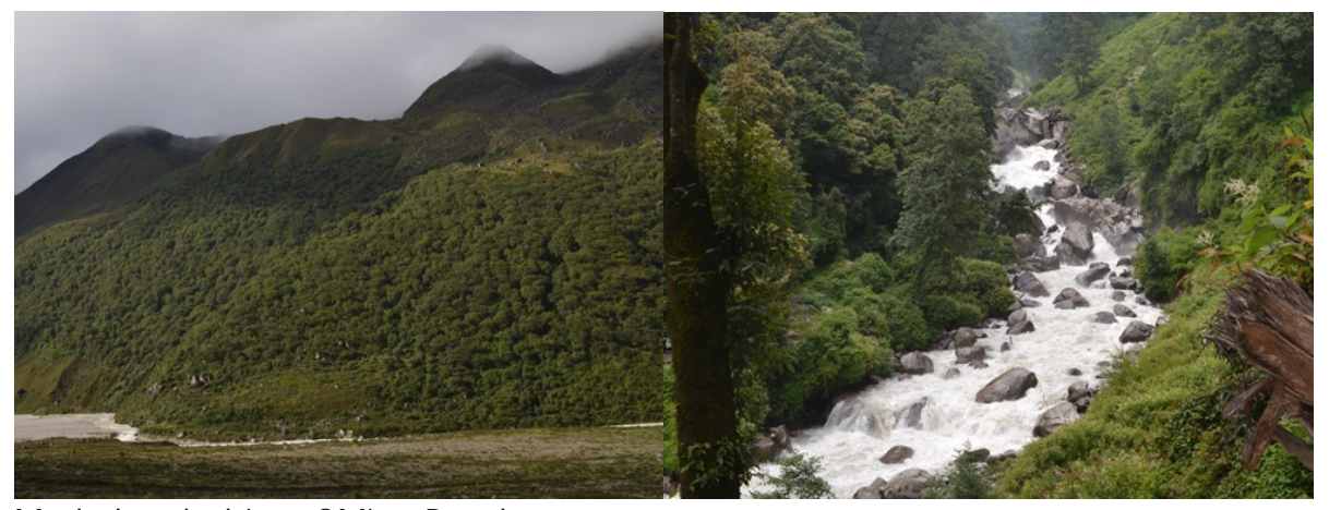
Musk deer habitat.