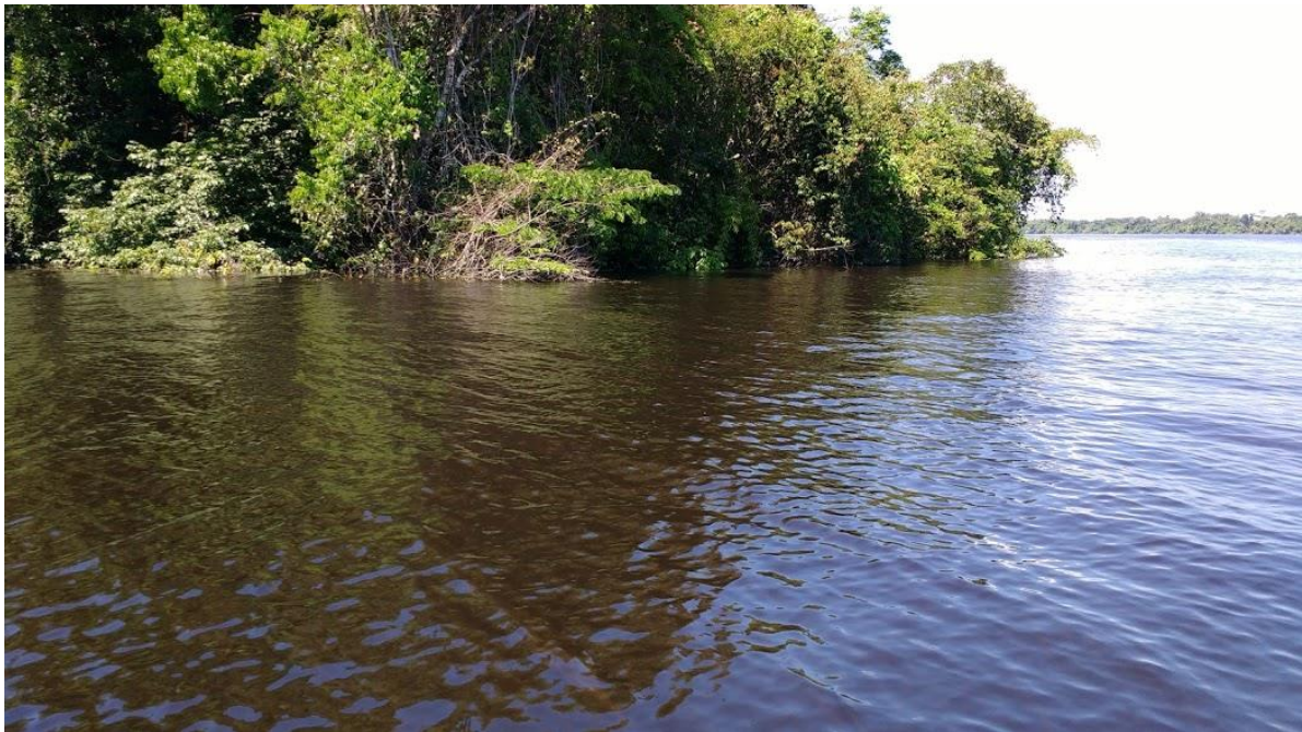
The left side of the archipelago heavy with sediments from the White River

I have just come back from the first pilot field study in the Anavilhanas National Park. I was there from the end of June for 1 week. The level of the Black River is still very high and the islands are still submerged. At this time of the year, I could clearly see the difference between the right and the left side of the archipelago. The right side has a black color from the Black River while the left side carries loads of sediments and it has a brown color similar to the color of the White River. At the moment, I am getting ready for the follow-up field work in the Anavilhanas islands which is now going to be from the end of August to the beginning of October or until the beginning of November when the soil will be more exposed.