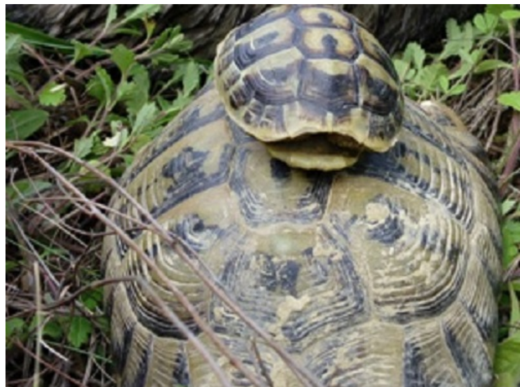
Adult female and juvenile Hermann's tortoise.