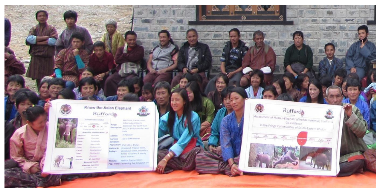
Communities of Jomotshangkha and Serthi HEC areas.

HEC (human-elephant conflict) is one of the major issues and bottleneck in conservation of Asian elephant in most of the area. The damage caused by the elephant in the human habitation and farmlands has made people to think negatively about the elephant and built negative attitude towards elephant conservation. Therefore, to coexist, human and elephant and to encourage communities to conserve the habitats of elephant in the long run, training workshop have been conducted in several HEC areas, consultative meeting with the key stakeholders and village prominent members were carried out which helped a lot in forming a community-based conflict management among the communities of HEC areas.