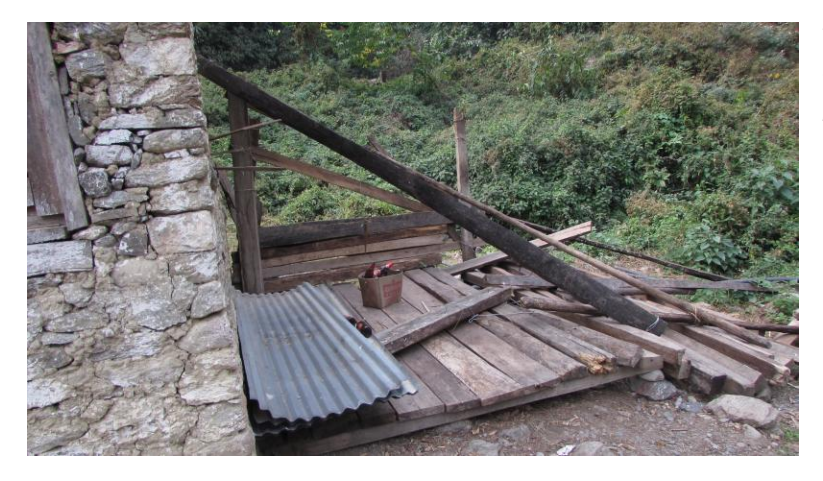
Temporary house at Gelongkhar damaged by Elephant