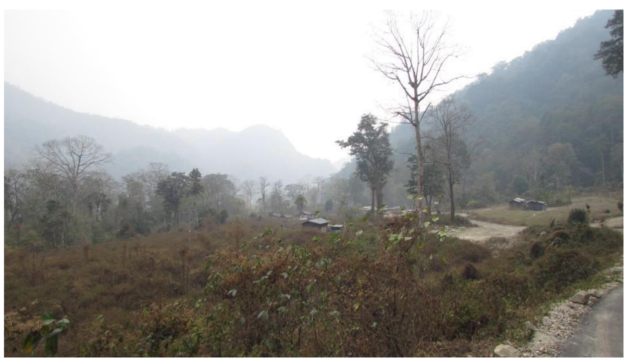
Village (Gelongkhar) frequently visited by elephants/Most HEC area