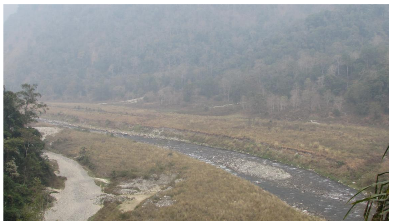
Summer habitats of elephant, Jomotshangkha