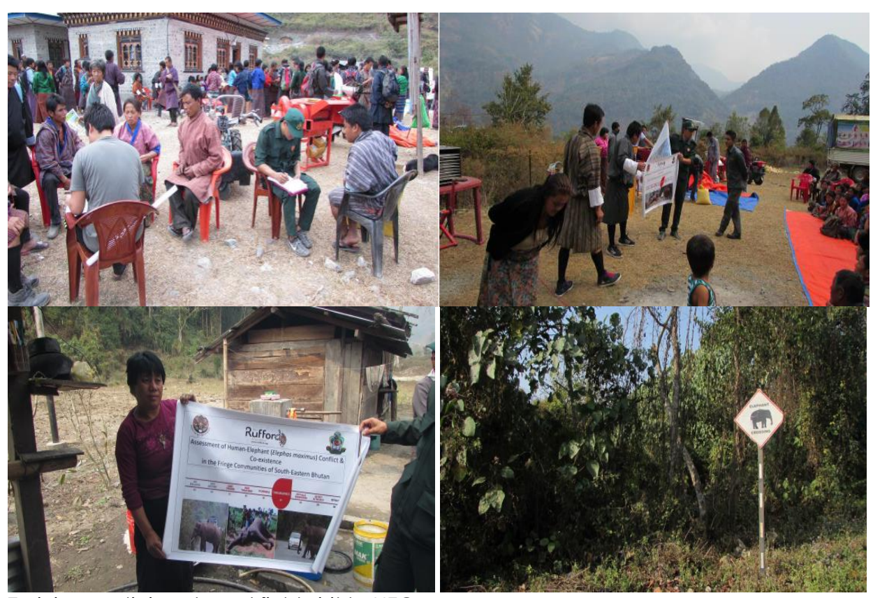
Training participants and field visit to HEC areas

Based on the proposed activities, discussion was thoroughly done and effective methods were made aware to people in the field. The team members and people's representatives were brief on the CBCM strategies and land use planning techniques. The people were also brief on the land use planning of cultivating non-palatable crops at the edge of farms and planting bananas in the fringe forest areas. The participants were taught on the tactics and ways to reduce HEC while coexisting with the elephants. It was known from the people that such awareness on basic ecology and behavior of the crop raiders should be organised to all the HEC prone areas in future to understand the behavior and relationship of the raiders and prepared for future self-security.