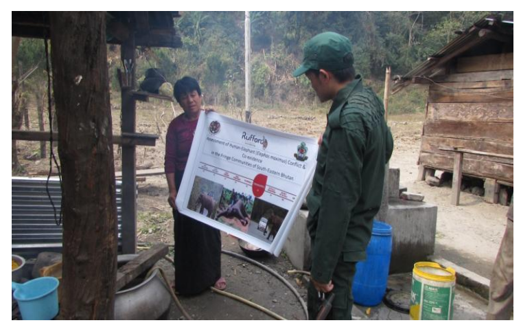
Household coexisting with elephant and its habitat