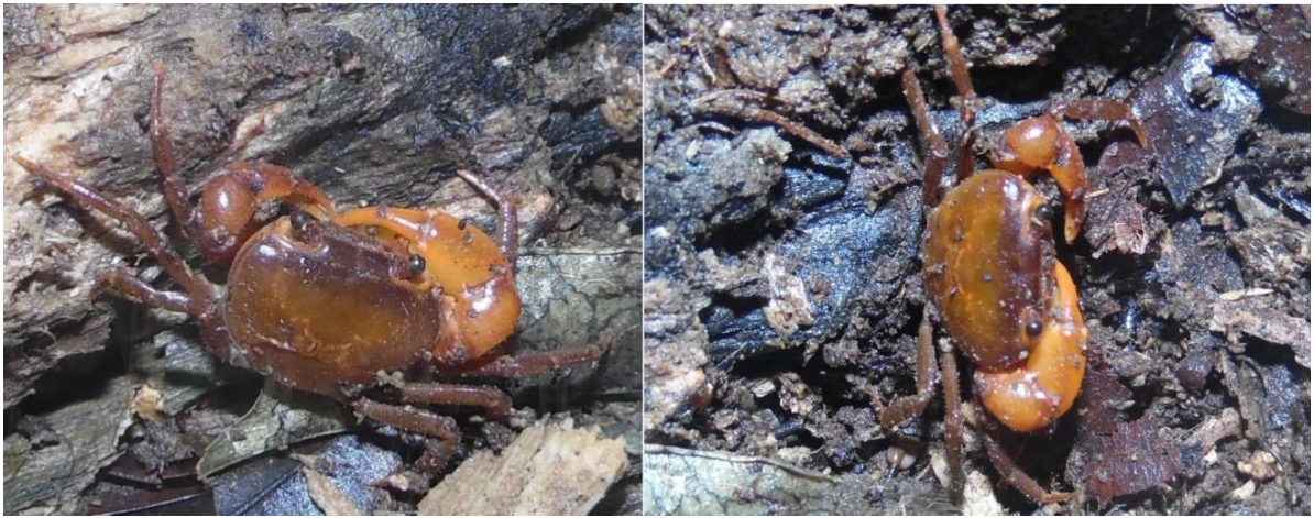
Figure 3. Louisea edeaensis