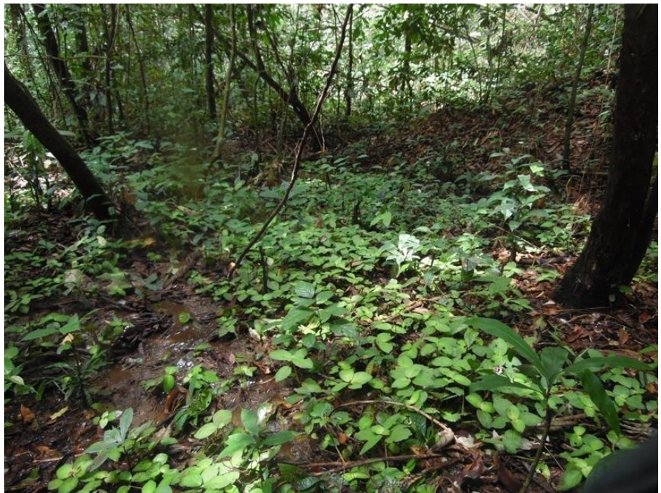
Figure 6. Aspects of the habitat of Louisea edeaensis from Bedimet Island of Lake Ossa