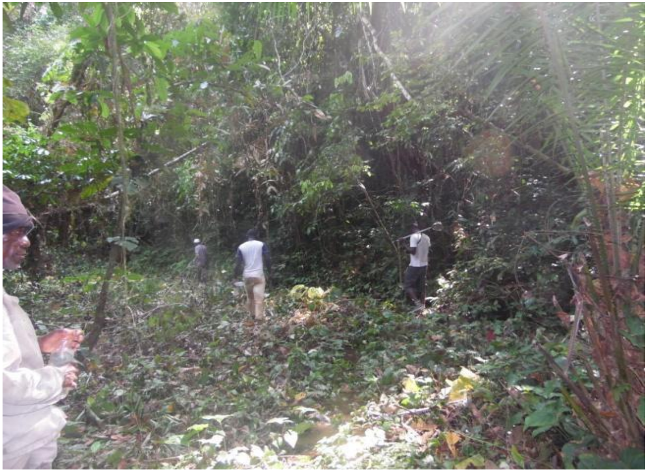
Figure 7. Bedimet Island of Lake Ossa, ongoing education component during fieldtrip.

We are convinced that our conservation actions aimed at protecting the habitat of L . edeaensis have been successful through the monitoring efforts we done during field trip. We have monitoring step by step the great education efforts including compensation for local farmers carried out at the end of each fieldwork. This was easy for us to do because we were working only on the Bedimet Island. The local farmers concerned with the compensation have definitively removed their farms from areas where we have seen specimens of L . edeaensis and where we are sure this species occurs. The changes from of all our education efforts were noticeable only after 7 months of work (i.e., in May 2017). We now intend to have discussions with the Cameroonian Government (Ministry of Forest and Wildlife) so that the areas where L . edeaensis occurs can become a RED ZONE and be protected by the local laws.