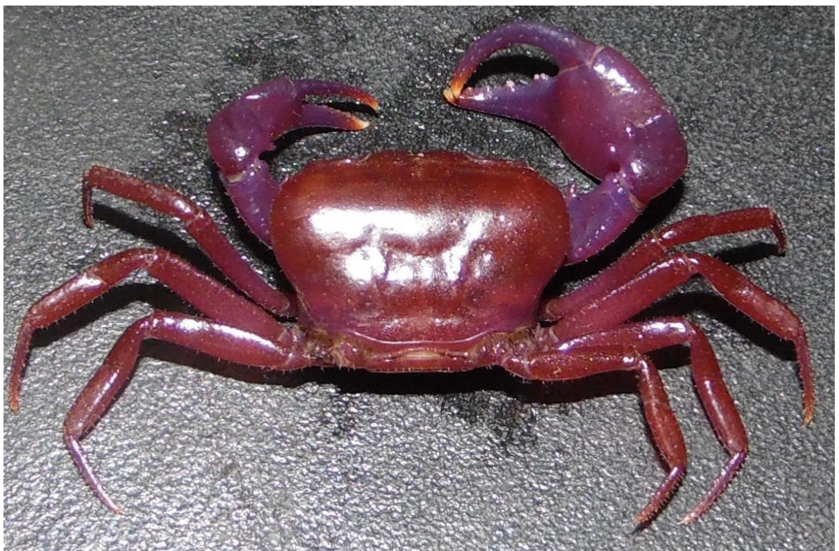
Figure 10. Recently discovered specimen of Louisea balssi from Lake Manengouba. CW =16mm. Specimen collected for taxonomy purpose.