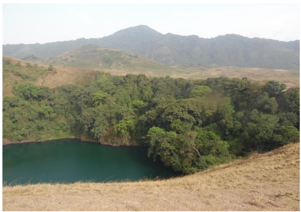
Figure 9. Lake Manengouba