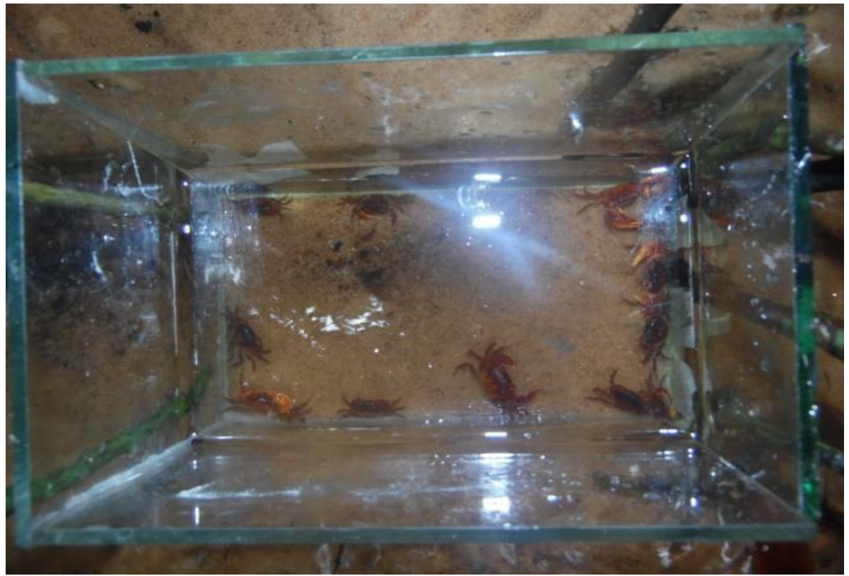
Figure 4. Specimens of L. edeaensis retained in aquaria during the field work