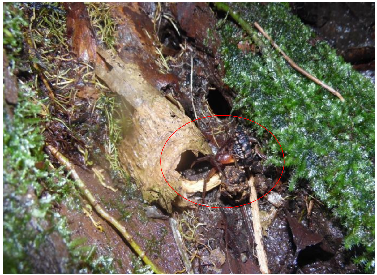
Figure 5. Louisea edeaensis carrying out the prey in its biotope.