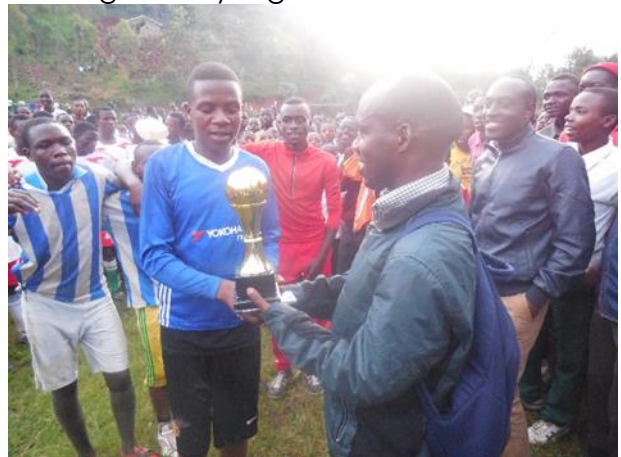
The Head Teacher of COM handing the cup to the winning Football team after messages of Nyungwe Conservation