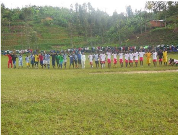
Teams ready for the football match