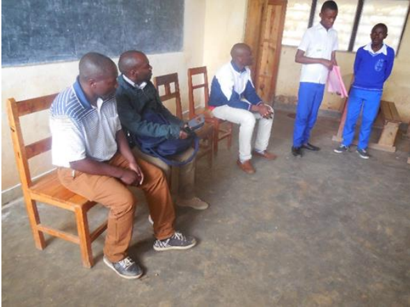
The panelists (chosen from the trained club mentors) following and assessing presentations