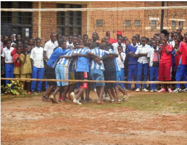
GSK Volleyball Team ready for the match