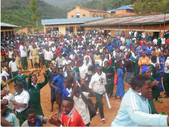
GSK Fans overwhelmed by the win