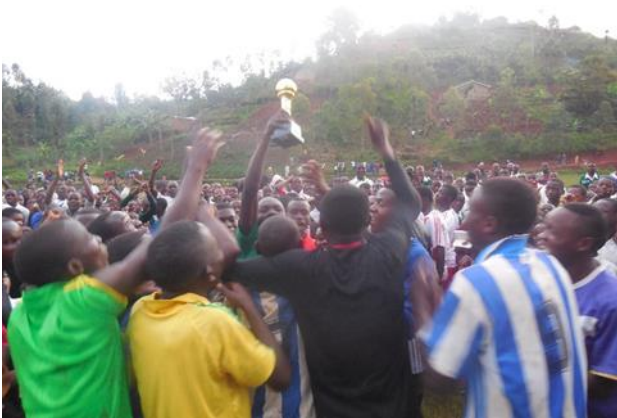
GSK Community celebrating the won football cup