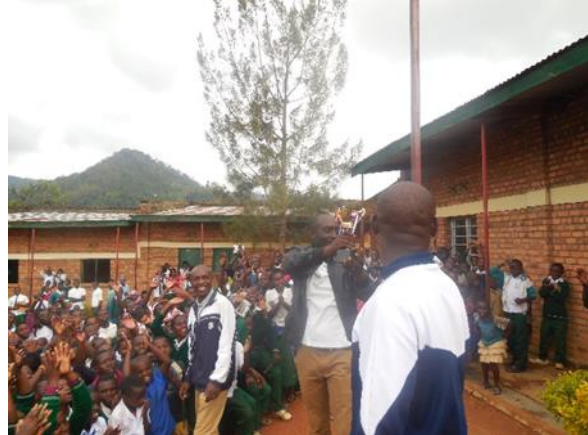
The Head Teacher of GSK handing the cup to the winning Volleyball team after messages of Nyungwe Conservation