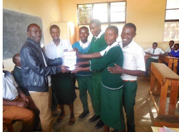
The Head Teacher of GSK handing awards to the winners