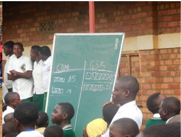
GSK won two sets over COM