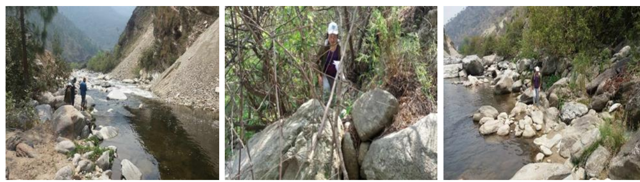
Bank site counts and field surveys in process

In the 2<sup>nd</sup> phase of the project, we focused on vegetation and habitat assessment and the bankside counts. It was conducted in entire project site which stretches about approximately 10.4 km in length. The assessment was done along the river by laying 10 m radius circular plot at every 200 m alternately (side of the river). We recorded tree species in the 10 m radius circular plot. Within 10 m radius circular plot, we recorded shrubs in 5 m radius plot and ground cover and herbs in 1 m radius plot. We laid and surveyed 52 plots in total. Through the entire plots, the dominant tree species was Pinus roxburgai . (Chirpine).