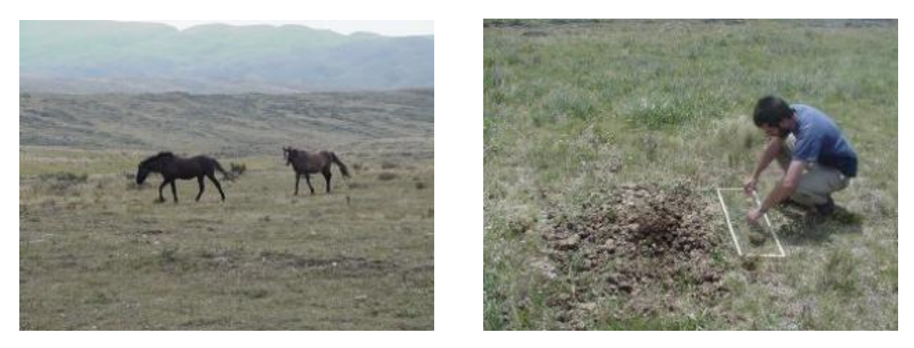
Feral horses in the Ernest Tornquist Provincial Park and sampling vegetation associated with manure patches.