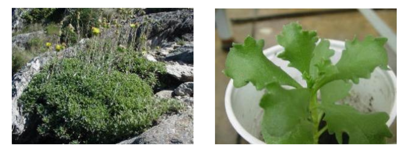
Grindelia ventanensis growing in a natural habitat in Ernesto Tornquist Provincial Park and cultivated in the Pillahuincó Botanical Garden.

Grindelia ventanensis grows easily from cuttings or seed, if these are collected from wild populations. However, the cypselas lose viability if stored for a long time unless they are kept in cold dry conditions. Their flowering period is seasonal and not very long, however their foliage is attractive and so their ornamental potential is equally high. It is recommended that seed from different populations is used to ensure a wide genetic base when cultivating this species from seed (20).