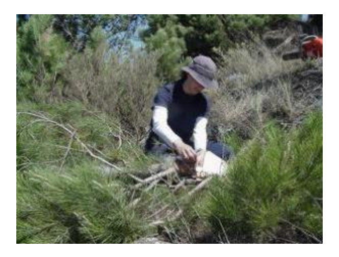
Felling of Pinus halepensis in the Ernesto Tornquist Provincial Park.