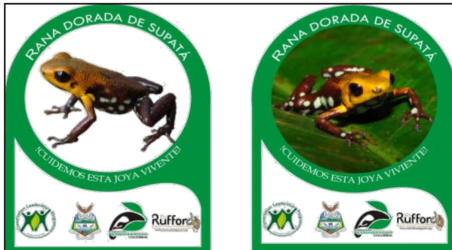
Stickers on the Supatá Golden Frog and its conservation

So far we designed two types of stickers that have been distributed in Supatá and its surroundings. With the slogan: “care this living jewel”, these stickers have been stuck on cars, windows and others place for remind to the Supatá people the commitment to protect this frog and its environment. Likewise, we designed a calendar for 2011, allegorical to the protection and conservation of the Supatá golden frog; this is currently being distributed in the municipality.