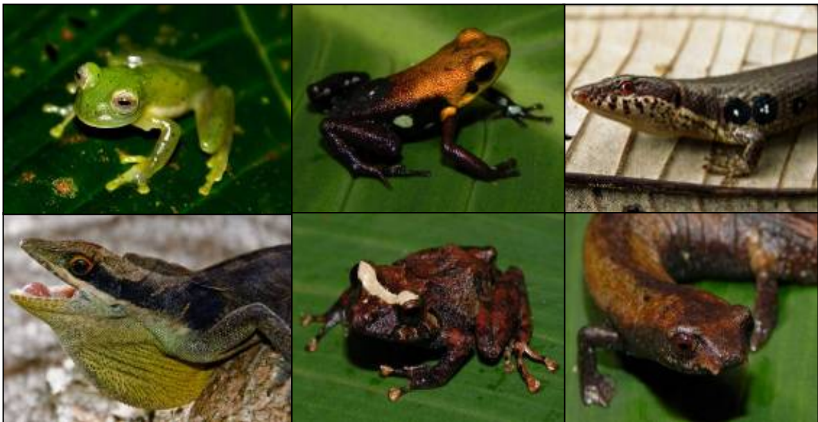
Some species of the herpetofauna registered in the Supatá area

The other activity that we are carry out in the research field work is the inventory of the herpetofauna of Supatá. So far, we have recorded 13 species of amphibians belonging to seven families and eight genera. Regarding the reptiles, we have identified 11 species belonging to four families and nine genera. We hope to start soon the editing and design of an illustrated guide to the Supatá's amphibians and reptiles to allow show the richness of these animals to the community in this area.