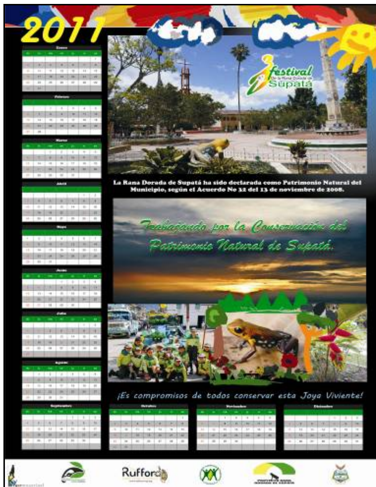
2011 Calendar allusive to the environmental work in Supatá