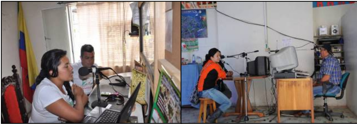
Members of the teamwork speaking in the Supatá radio station about diverse environmental issues

So far we designed two types of stickers that have been distributed in Supatá and its surroundings. With the slogan: “care this living jewel”, these stickers have been stuck on cars, windows and others place for remind to the Supatá people the commitment to protect this frog and its environment. Likewise, we designed a calendar for 2011, allegorical to the protection and conservation of the Supatá golden frog; this is currently being distributed in the municipality.