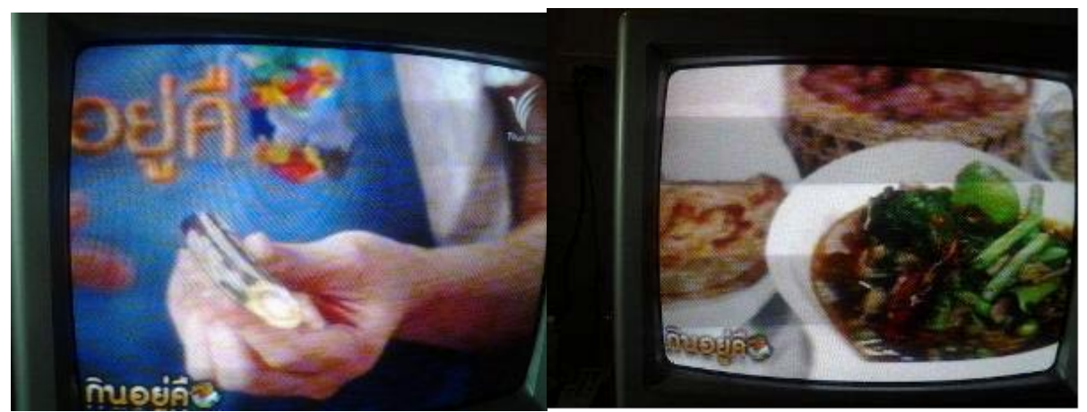
The spindle-shaped fruits Bruguiera gymnorrhiza when mature shown in the TV screen.

"Eat Am Are" explores the idea that a single dish can reflect a world of art, culture and tradition by telling the stories behind what various local communities put on their tables.