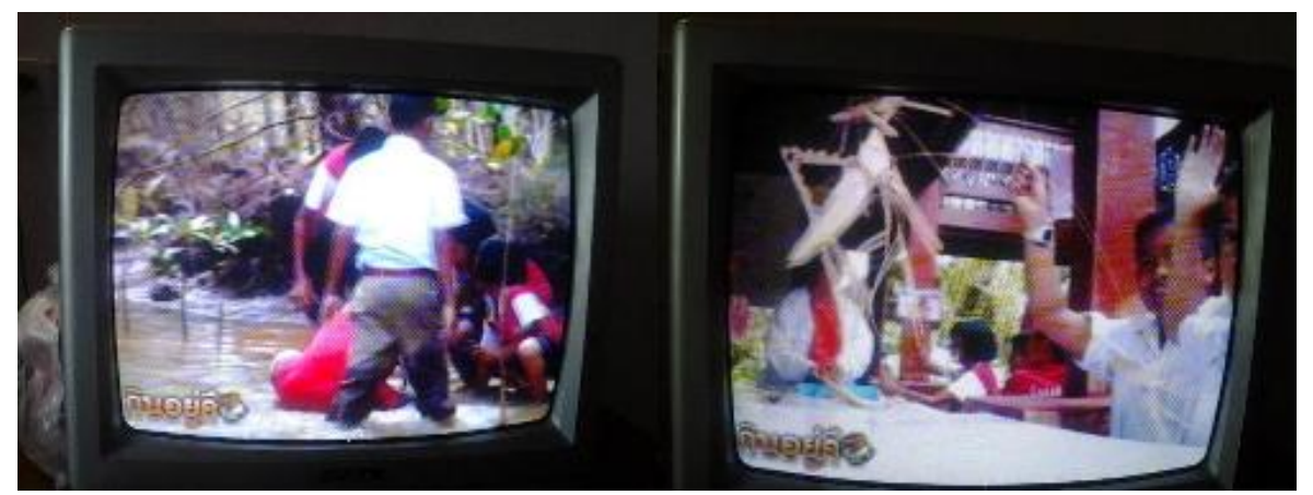
Community students were in the scenes of replanting and Mangrove Processing Training.

The broadcasting day of our RSG works in "Eat Am Are" Program on Thai PBS TV.