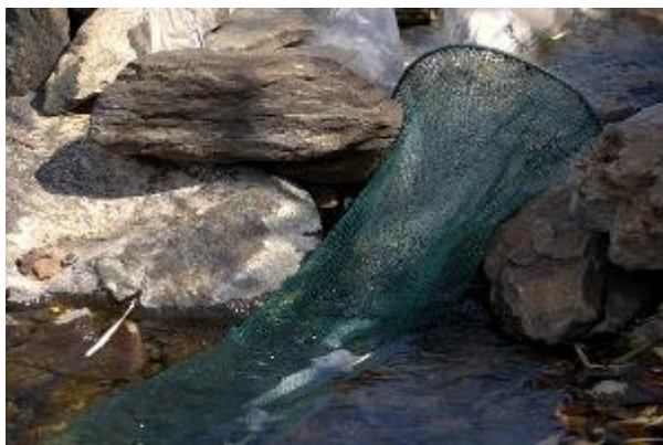
Pic 2_A Sleeve net