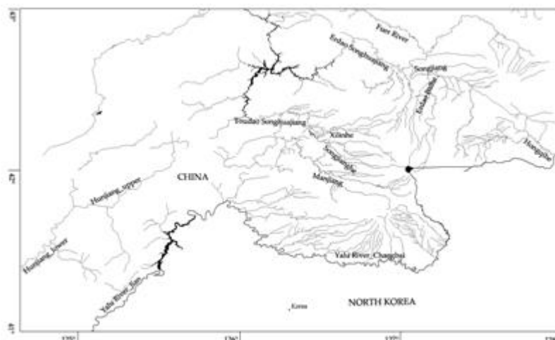
Map 1__The Study Area and River Stretches Surveyed in Spring, 2009

ducklings of the Scaly-sided Merganser once were seen in Yalu river. So we set two survey stretches in both the upper and lower reaches of this river in this spring.