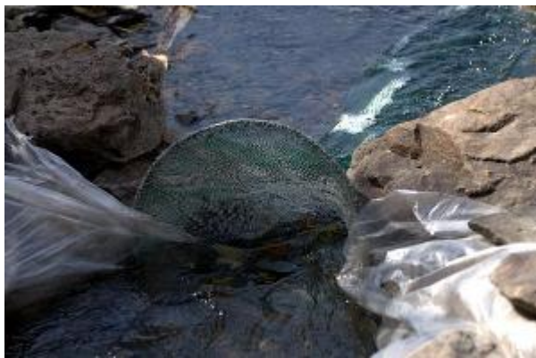
Pic 1_A Sleeve net

Pic 1 and 2 describe a trap net used by local people to catch fishes and frogs. As its shape is much like a sleeve, so it is named as sleeve net. Even we have not seen for ourselves how this net may catch Scaly-sided Merganser ((especially ducklings), but we can often hear the stories of how this kind of nets caught the broods of Scaly-sided Merganser.