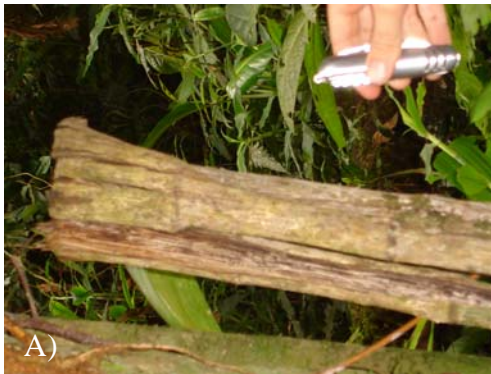
Figure 4.- Andean bear signs of the Sign Aging Project : A) Macanilla ( Wettinia praemorsa ) no longer distinguish as bear-sign after eleven months. B) Andean bear deep claw-mark distinguishable as bear-sign after twelve months. C) Palmiche ( Geonoma undata ) distinguishable as bear-sign after twelve months. D) Andean bear deep claw-mark distinguishable as bear-sign after twelve months.

Continuing with the activities started on August 2005, a monthly visit was conducted to the Sign Aging Project set in Cubiro, by the project team as a whole. Eaten bromeliads, Mapora ( Prestoea acuminata ) palm trees, rubbing trees, day-beds, superficial claw-marks, tracks, scats, hairs and some bitten roots were no longer distinguishable as bear-signs after six months (See Figure 4). The visits concluded after on year survey, and only deep claw-marks on trees and some palm trees of the Geonoma and Wettinia genera were identify as bears-signs until the end (See Figure 4).