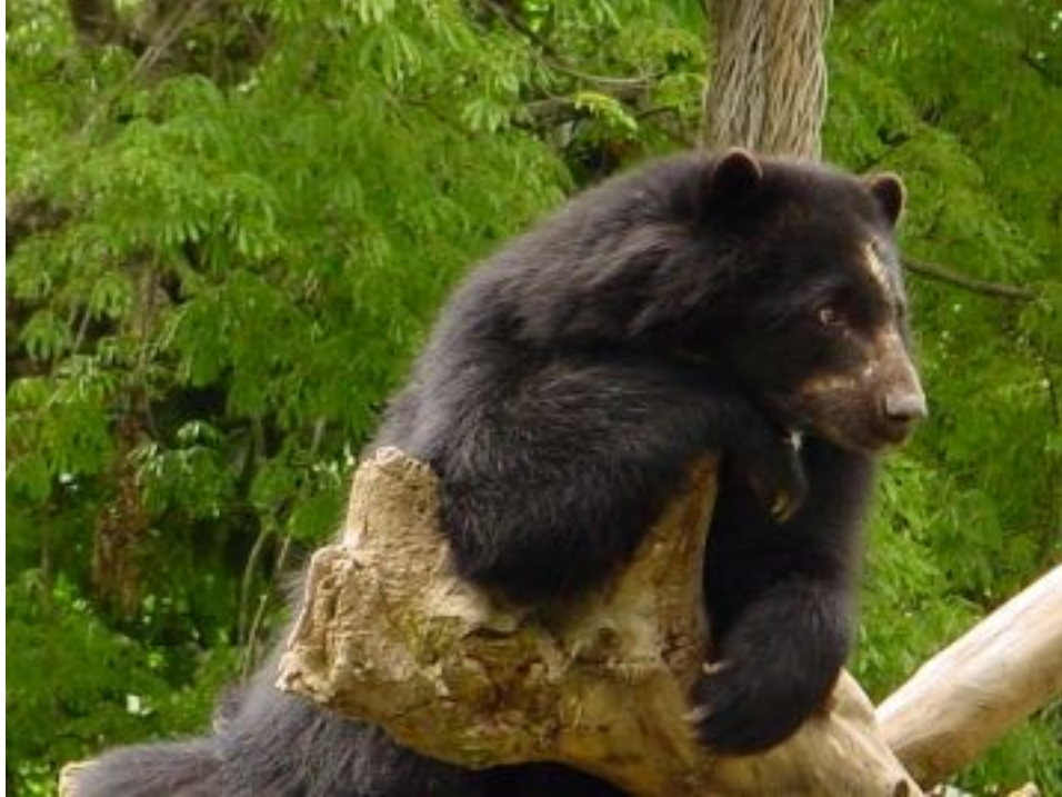
Andean bear ( Tremarctos ornatus ) (Lizcano, 2003)