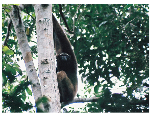
Adult male gibbon ( Hylobates albibarbis )

The aim of this study was to investigate the relationship between vegetation characteristics and gibbon density in a newly protected, secondary peatswamp forest in the Sebangau National Park. The study was conducted from February to July 2008, using auditory sampling methods and speed plotting. Gibbon densities and vegetation characteristics were recorded at 13 sites within the Natural Laboratory for the Study of Peat-swamp Forest ( LAHG ) operated by the Centre for the International Management and Cooperation in Tropical Peatlands (CIMTROP), based at the University of Palangka Raya. As mentioned, threats to the area and the primates are numerous: