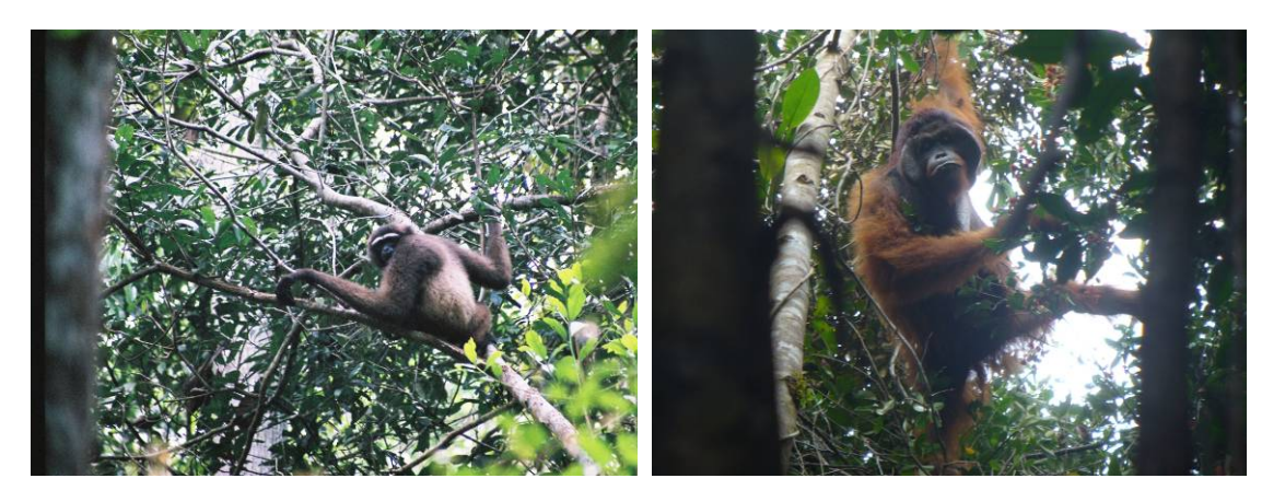
Adult male Bornean agile gibbon ( Hylobates albibarbis )

Although the area has recently been given protected-area status, the Forest is not immune from these problems, and there continue to be numerous challenges ahead. The habitat has undergone many years of disturbance, including uncontrolled illegal logging, which has resulted in drainage of the area and fires. Exploitation of the forest and its wildlife remains a concern; particularly as many of the surrounding populace formerly relied on logging as their major source of income.