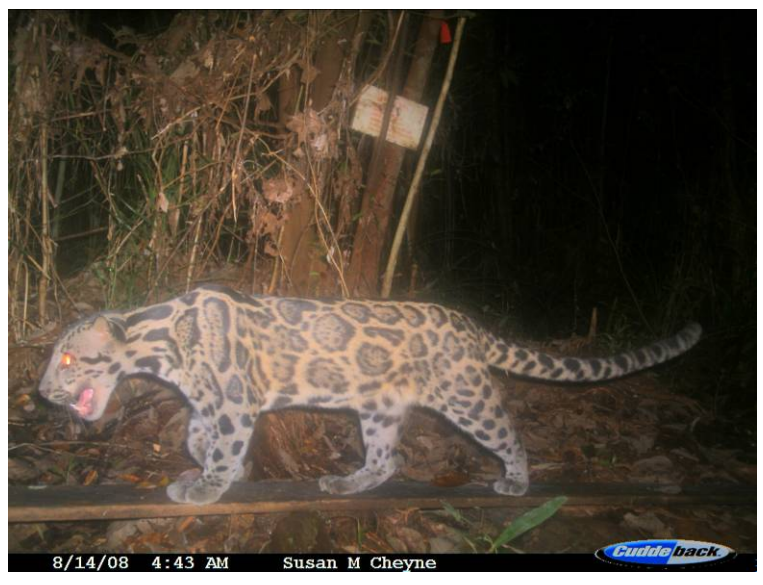
Male clouded leopard

In the first three months of this project we have confirmed that the Sabangau National Park is indeed home to the largest predator on Borneo – the Bornean clouded leopard ( Neofelis diardi ). A great deal remains to be discovered about these cats. Of top priority is finding out more about the population size in the Sabangau National Park, and more about possible threats to them. Unlike the apes, the cats require mammal prey and over-exploitation of bearded pigs ( Sus barbatus ), lesser mouse deer ( Tragulus javanicus ) and pangolins ( Manis javanicus ) for bushmeat could be impacting on the clouded leopards.