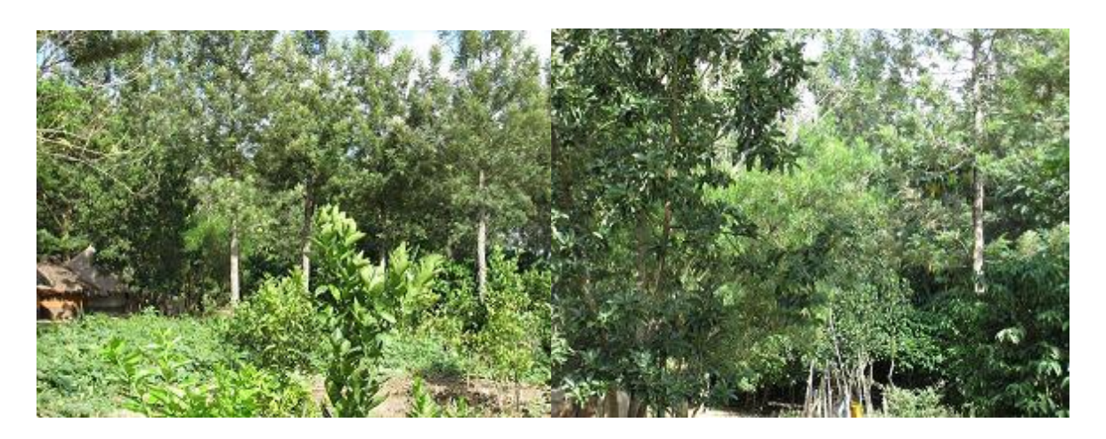
Figure 9: A Mixture of Oranges, Avocado, and Neem and coffee plants at Mzee Odong's FF farm