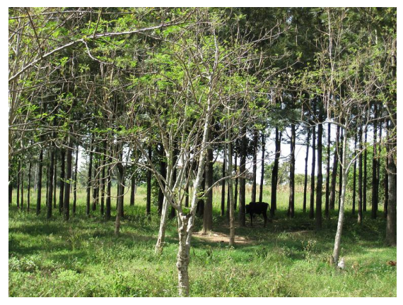
Figure 7 : Awuku's FF farm: Some patchiness developing Figure 8 : Some Moringa and Neem trees interplanted in a an originally bare land two years ago)