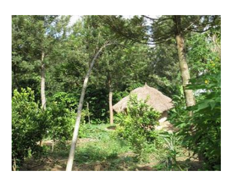
After – Mature trees (Oranges, Neem and Moringa) (2008)