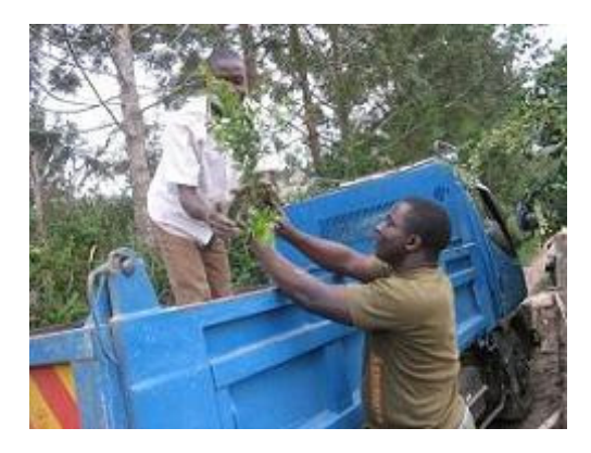
Figure 3: Seedlings transport

The seedlings were delivered to the planting sites and great care was taken to avoid damages. A truck was used to transport the seedlings to the planting sites (Figure 3). During movement, care was ensured to avoid damages. On the plantation sites, plastic basins were utilized to carry seedlings to the required planting spots. Loading was done with utmost care to avoid damages especially to the roots, and keeping the soil and roots intact. The off-loading of seedlings at the planting site was also done with care to prevent exposure of the roots to the sun.