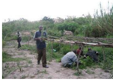
Figure 4: A tree nursery in Kooki county County