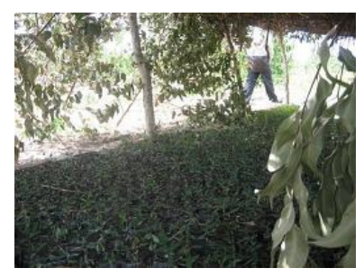
Figure 5: A tree nursery in Kooki County

Kakuuto and Kooki community has learned to make reforestation and FF profitable. After selected number of CBEWs taking a course in tree nursery reforestation and FF, the group saw the potential in continuing tree production as a vital part of reforestation efforts in Uganda. While the community had already planted 4,000 trees to reforest their surroundings in Sangobay, it is expanding its tree production to keep up with future demand for good tropical hardwoods like eucalyptus, pine. The Kooki group still has close to 5,000 seeds germinating (Figure 5), and all of them are already destined to be planted on local farms in this important FF effort. Forestry authorities are taking notice of the efficient tree nursery, offering them a great economic opportunity. Clients outside the project area have agreed to buy trees from the Kakuuto and Kooki groups, hence compelling them to expand their annual production capacity twenty-fold to 100,000 trees come the 2009 wet season. Since FF is currently an important ongoing effort all over Sango-bay, the tree nurseries will likely enjoy a healthy market for decades to come, offering employment to both men and women in the community.