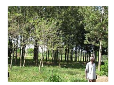
Before – Open land nearby a papyrus swamp (2005) After – Mixture of neem, Moringa Oranges (2008)