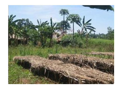
Before – Open space with our tree nursery (2005) After – Grown mixed trees (2008)