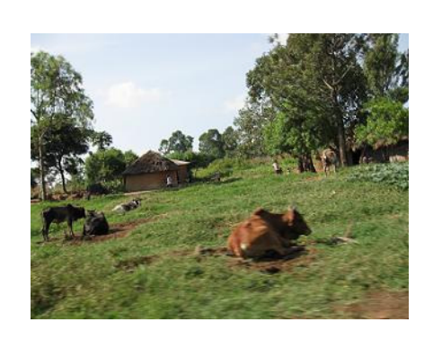
Before –Free open space (2005)