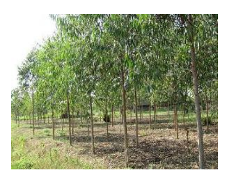
After – Grown Eucalyptus trees (2008)