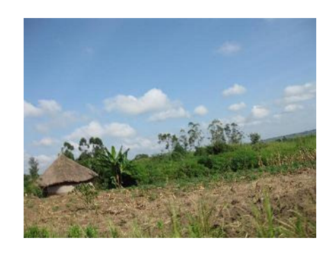
Before – Open space (2005)