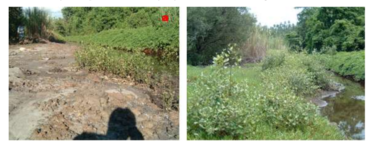
Figure 5. (a) early stage establishment of A. marina , (b) current condition.

Figure 5a,b shows different condition of establishment process on landward margin of the restoration site. The colony of A. marina seedling was firstly observed in three months after the hydrology of the site was restored (Figure 5a). Rapid growing of the colony can be seen in the Figure 5b. The colony remains dense and individual trees are healthy. It is expected that the colony may be successful in colonising this location.