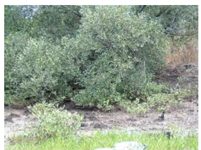
Figure 2. A. marina seedlings near their parents

may not invade the middle and seaward margins of the restoration site. The most possible places of establishment of this species may be the site with relatively hard and sandy substrate on the landward margin. Seedlings of S. alba and R. apiculata are common within the restoration site. These two species are expected to dominate the future community structure of mangrove within the restoration site. Field observation indicates that seedlings of these species have started to invade the middle area and landward margin of the restoration site (Figure 3 a,b).