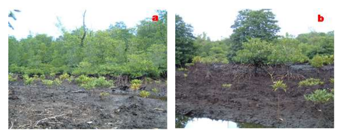
Figure 7. (a) replanted seedlings of R. apiculata and B. gymnorrhiza on ascended tidal channel, (b) the same seedlings near the tidal channel.

In the first stage of the project, a number of seedlings and young trees of R. apiculata and B. gymnorrhiza was planted along the north tidal channel, on already ascended channel and on accreted mangrove area to the north. These replanted seedlings grow relatively slow along the tidal channel and on ascended channel (Figure 7a,b). But, about half of them died on accreted mangrove area. The hydrological change seems to have little effect on this specific area.