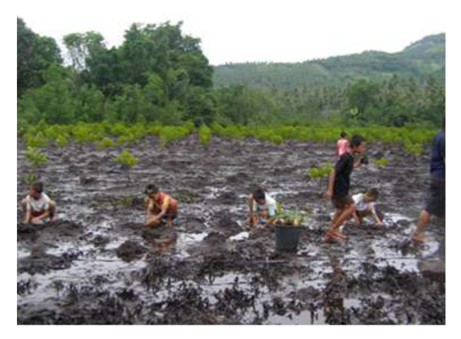
Figure 8. Stunted growth of C. tagal and R. apiculata on accreted mangrove area to the south.

When mangrove logs are moving freely within the restoration site, they may kill seedlings and young trees. The process of new establishment in the site may be influencing by the presence of free moving mangrove logs. During the period of the project implementation, the project team has secured the restoration site from 48 free moving mangrove logs with diameters ranging from 20 to 80 cm. Figure 9 shows the project team tying up mangrove logs to steady stakes. To minimise the restoration site from being disturbed by local community, the site was controlled regularly and a board informing the conservation status of the mangrove was set.