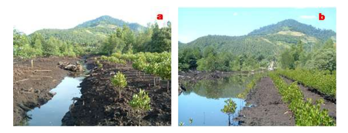
Figure 6. Fast growing of replanted young trees of C. tagal :(a) condition on October 2006, (b) condition on April 2007.

In the first stage of the project, a number of seedlings and young trees of R. apiculata and B. gymnorrhiza was planted along the north tidal channel, on already ascended channel and on accreted mangrove area to the north. These replanted seedlings grow relatively slow along the tidal channel and on ascended channel (Figure 7a,b). But, about half of them died on accreted mangrove area. The hydrological change seems to have little effect on this specific area.