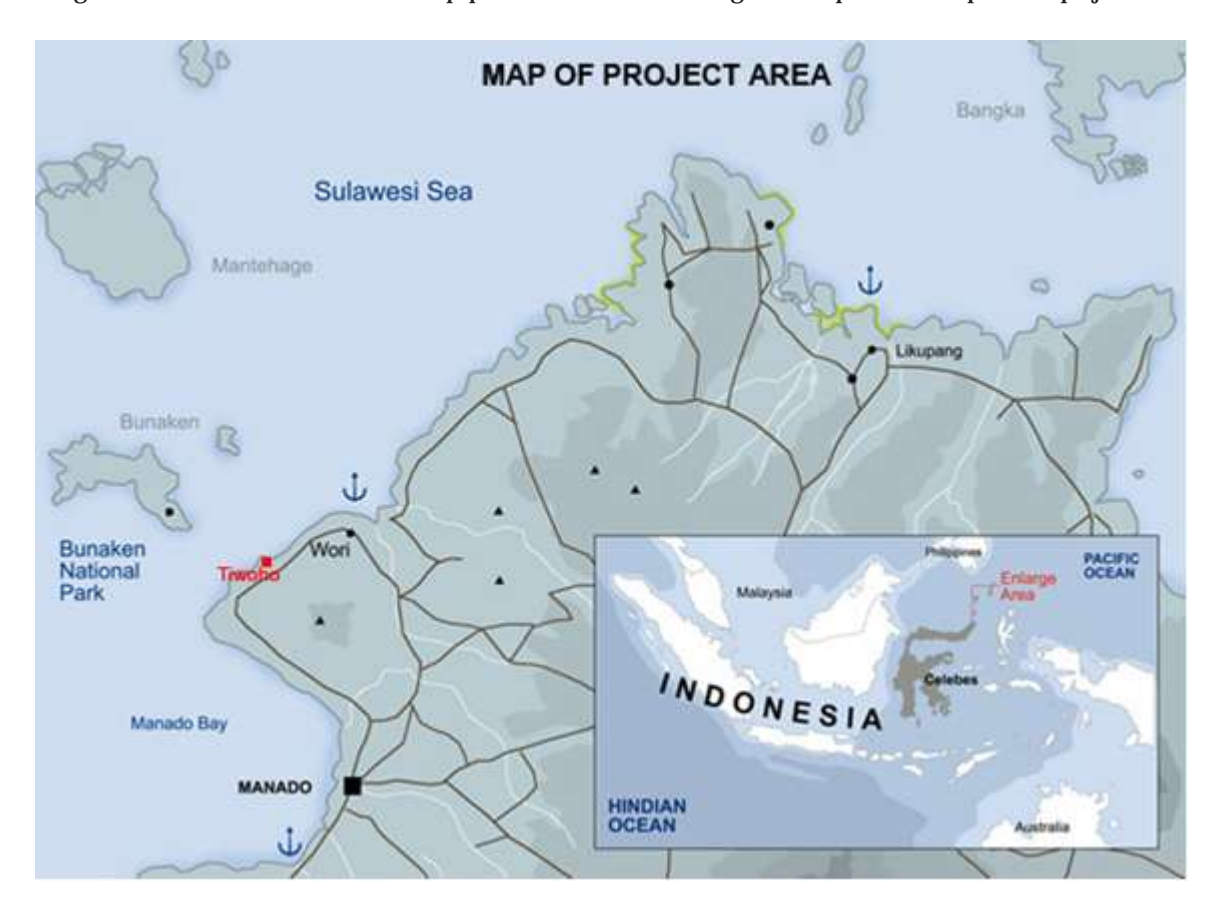
Figure 1. Map of the project site

The project is undertaken in the mangrove forest of Tiwoho, Bunaken National Park, which is located on the Coast of North Sulawesi, Indonesia (between 01^{\circ}35'00" - 01^{\circ}36'2.00" N; 124^{\circ}50'.21.06" - 124^{\circ}50'.47.10" ). In 1991 some 12 hectares of mangrove area was converted to shrimp ponds at this location. Figure 1 depicts the map of the project site.