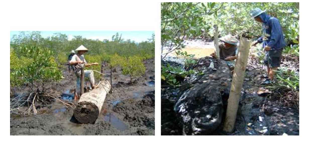
Figure 9. Mangrove loges are tied up to steady stakes

When mangrove logs are moving freely within the restoration site, they may kill seedlings and young trees. The process of new establishment in the site may be influencing by the presence of free moving mangrove logs. During the period of the project implementation, the project team has secured the restoration site from 48 free moving mangrove logs with diameters ranging from 20 to 80 cm. Figure 9 shows the project team tying up mangrove logs to steady stakes. To minimise the restoration site from being disturbed by local community, the site was controlled regularly and a board informing the conservation status of the mangrove was set.