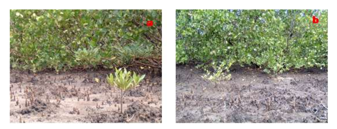
Figure 3. (a) established seedlings of R. apiculata , (b) seedlings of S. alba

Figure 4 shows detail composition and number of mangrove species that have established during field observation. Data in this Figure are from seven sampling quadrates set up within the restoration site, and not included replanted seedlings of C. tagal . As can be seen in the Figure that seedlings of R. apiculata and S. alba have increased continuously and they have been present at almost all sampling locations. This pattern may indicate the future structure of mangrove on the restoration site that will be dominated by the two species. In comparing to seedlings of R. apiculata and S. alba , seedlings of A. marina are less abundant and they are present only at two sampling locations on landward margin. Meanwhile, seedlings of B. gymnorrhiza are found only at one sampling location, and some of them are no longer to survive.