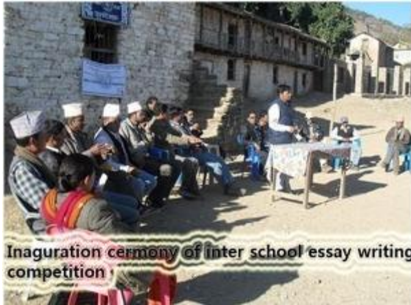
Inauguration ceremony of inter school essay writing competition