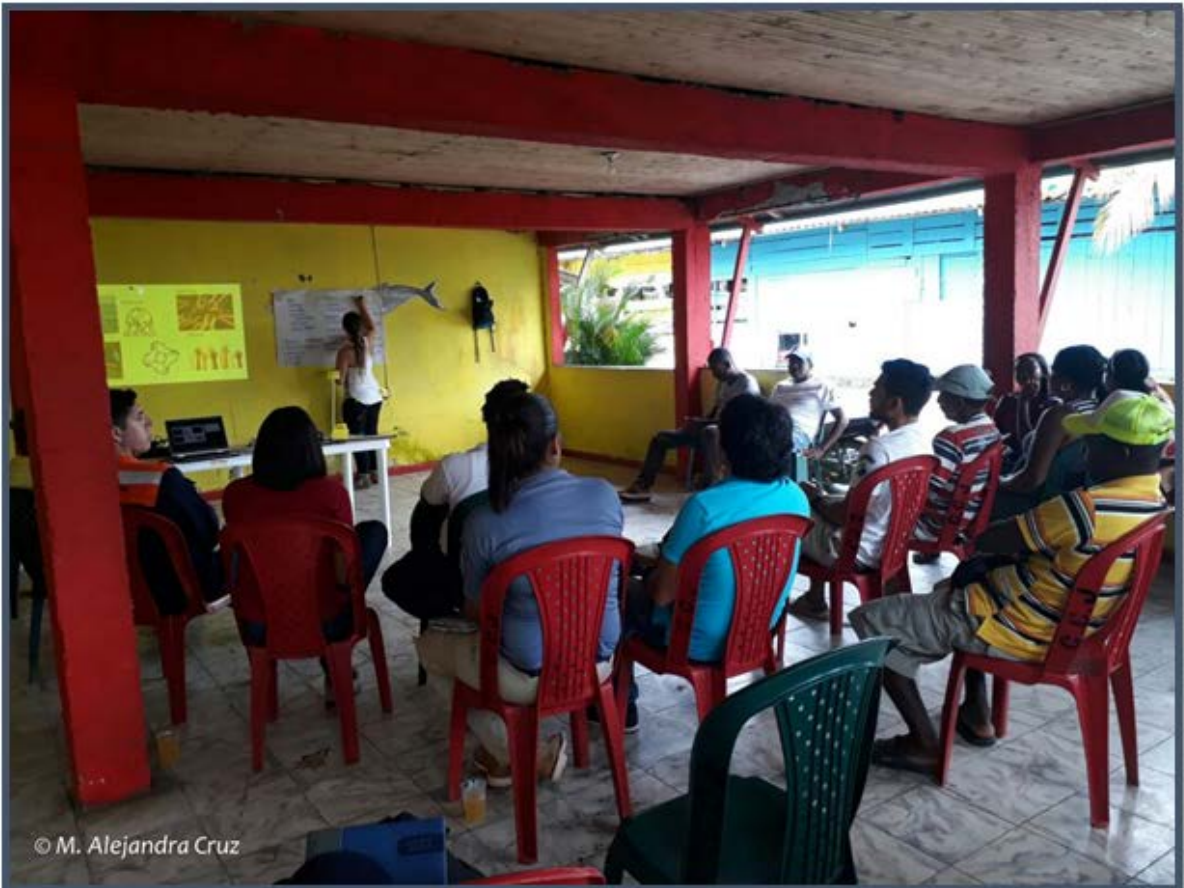
Workshop session with the assistants of the different entities and groups.