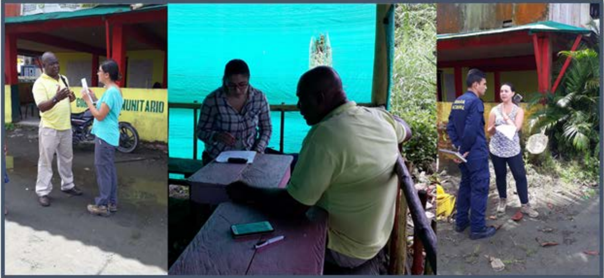
Interviews made by the team of the project to representatives of the entities of the CVC, the Community Council of La Barra and the National Navy.