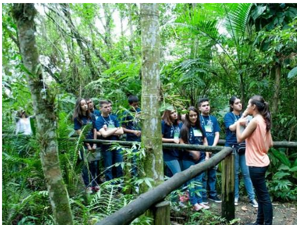
Local school students at the workshop to mitigate poaching in the region.