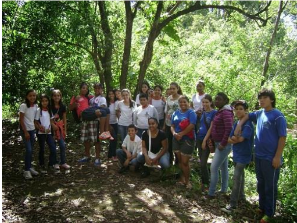
Local school students at the workshop to mitigate poaching in the region.

Since the last report in December 2016, we have carried out two more data collection expeditions. The state of Espírito Santo is facing an outbreak of yellow fever and this has caused the deaths of several primates throughout the state, including in our area of study. We still do not know the size of the impact of this dramatic event on populations of primates. In conjunction with these two expeditions, we held two workshops with the local population to raise awareness of the need to mitigate poaching in the region.