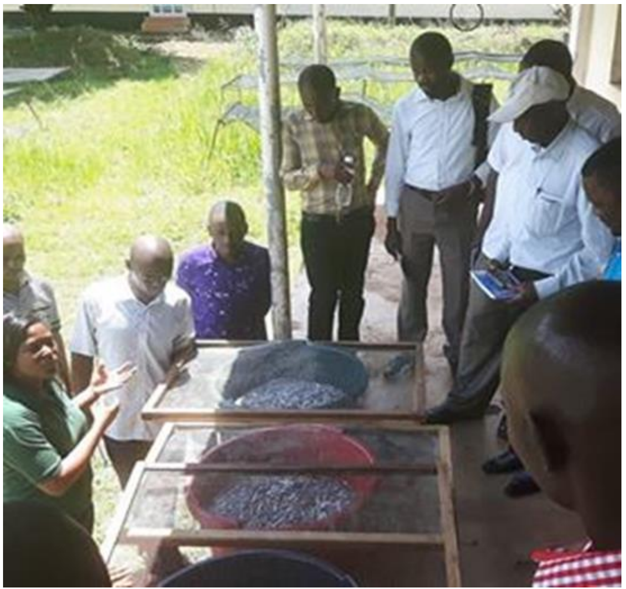
Figure 1: Community members being shown part of the catch and description of different fish species from L. Kanyaboli

Work package 1: Detailed monitoring and surveying of endangered fish: nets were set by designated fishermen and there catch time and date recorded. The number and species of each catch was carefully recorded for each of the sites. During January and February 2017 the catch was lower compared to end of March and April. Numerous catfish were also collected from the sites closer to the papyrus swamps.