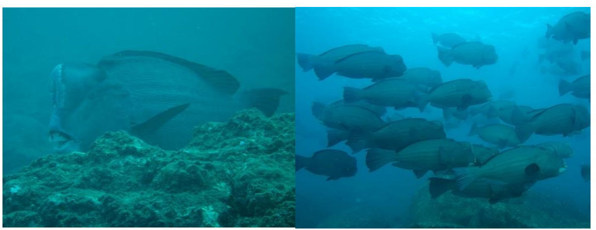
Left: An adult sighted at South Andaman dive site Chidiatapu. Right: A group of bumphead parrotfish sighted at Corruption point, South Andaman