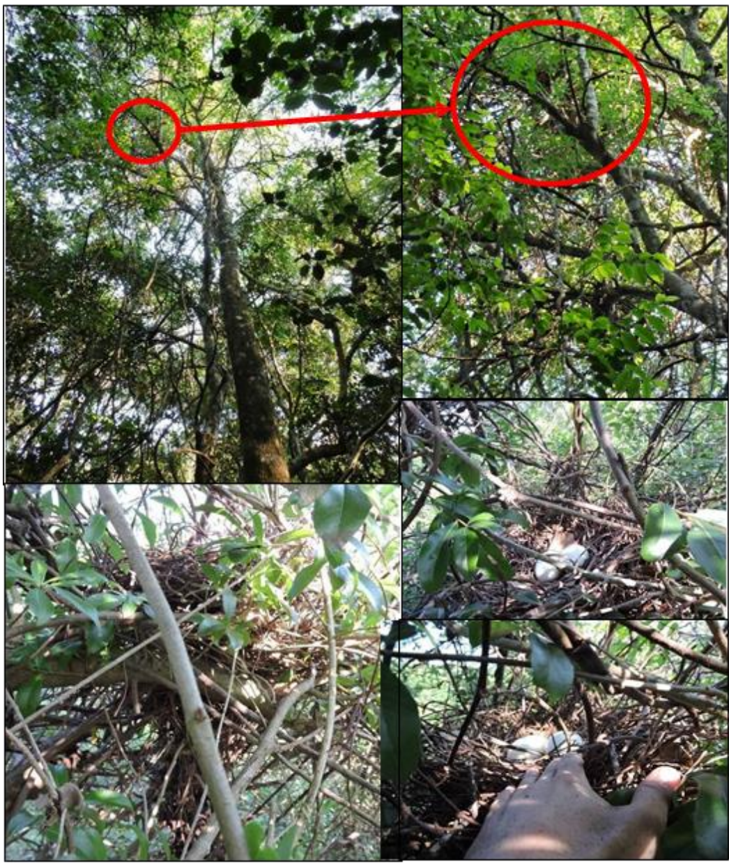
Figure 9: Bare-faced Curassow nest found in an important area for the conservation of the species.