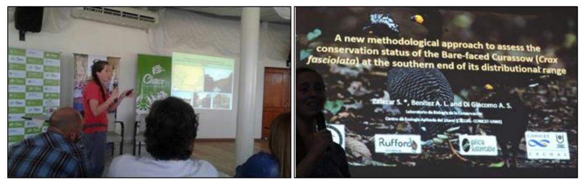
Figure 5: Upper: Meetings with local people and government authorities. Below: Public talks and scientific presentations.