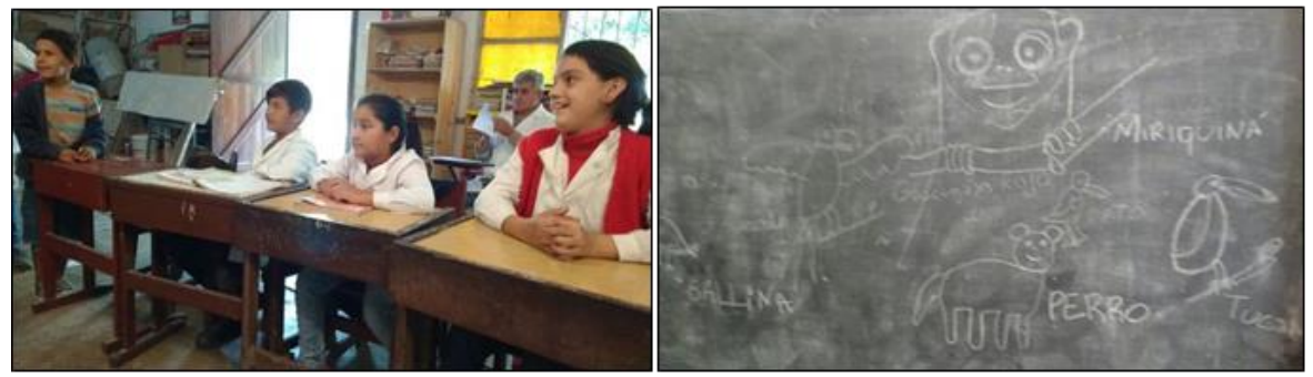
Figure 4: Workshops in the school of Colonia Dalmacia in the Monte Lindo River.