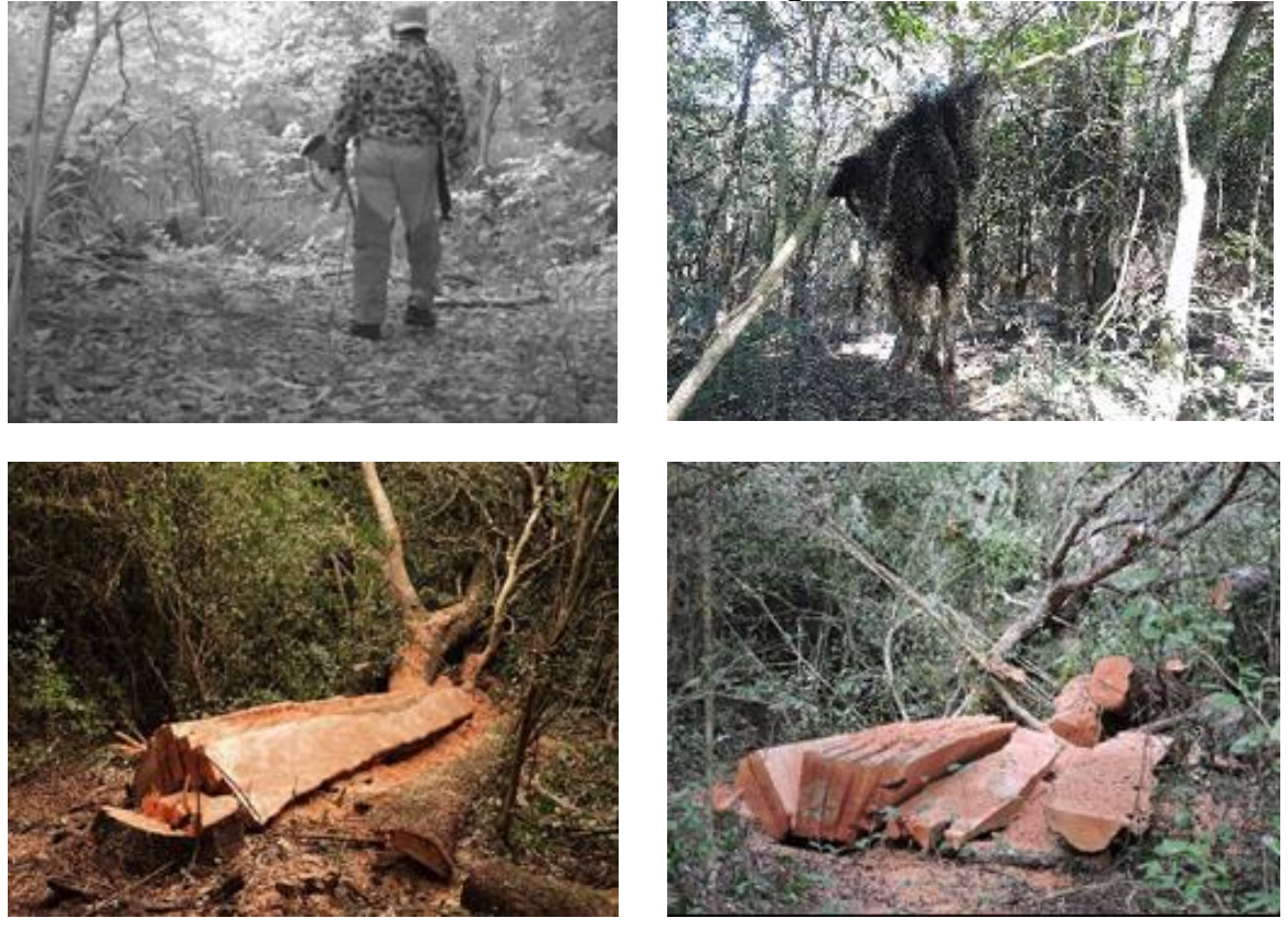
Figure 3: Presence of hunters and wood extraction in the gallery forests of the Monte Lindo and Pilagá rivers.

Figure 2: Fieldwork to determine the forest's use and spatial distribution of the Bare-faced Curassow in the Monte Lindo and Pilagá rivers.