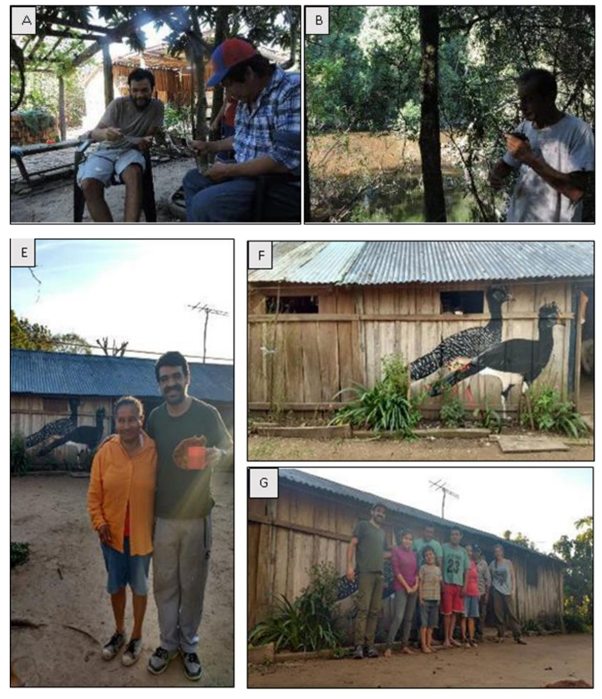
Figure 6: Activities carried out in Colonia Dalmacia and Mojón de Fierro. Photos A-D: surveys to local people. Photos E-G: Mural made with the Acosta family and neighbors.