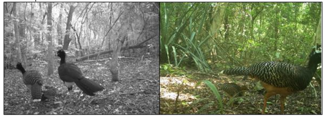
Figure 10: Bare-faced Curassow pairs with chicks found in an important area for the conservation of the species.