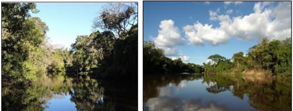
Figure 8: Gallery forests in the important areas for Bare-faced Curassow conservation.

Figure 7: Location of the two areas identified as important areas for conservation of the bare-faced curassow.