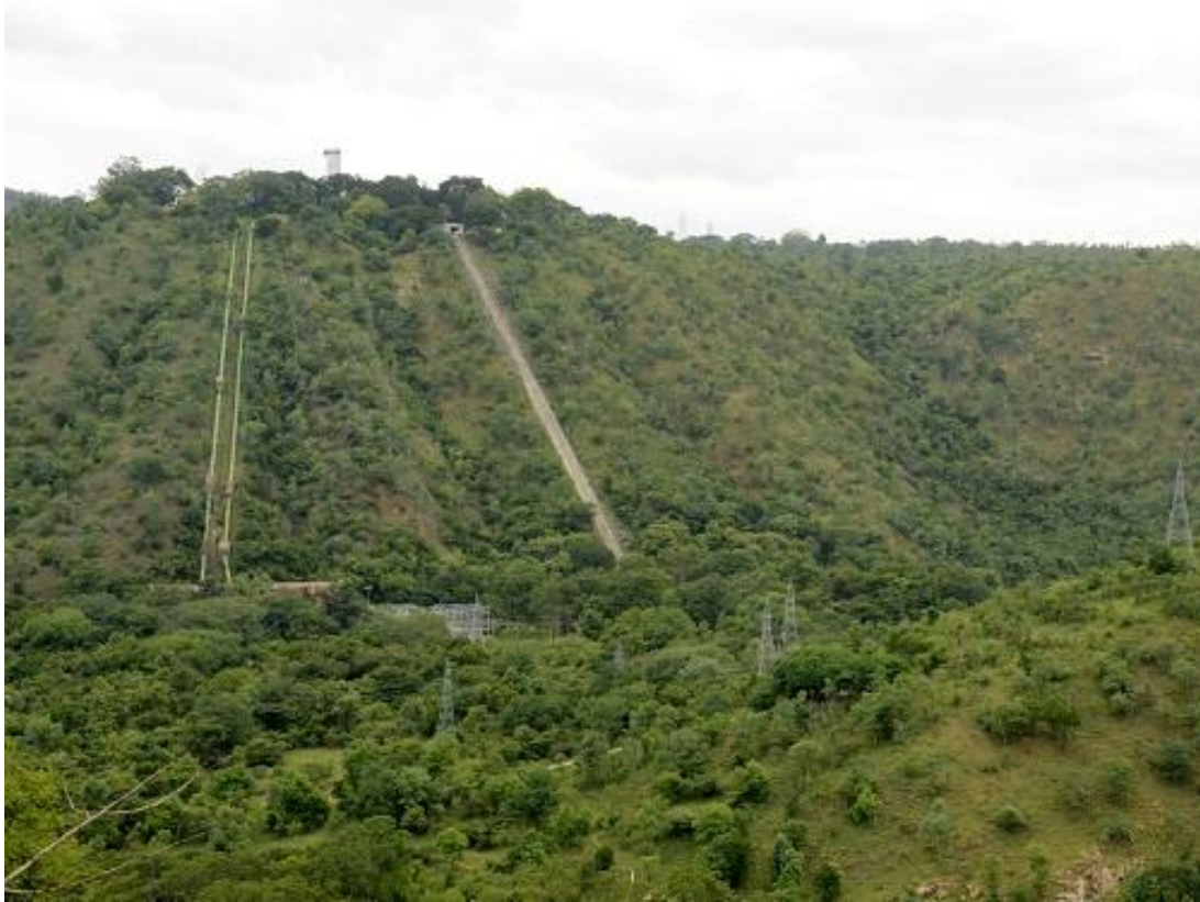
SHP related ancillary structures crisscrossing across a forest