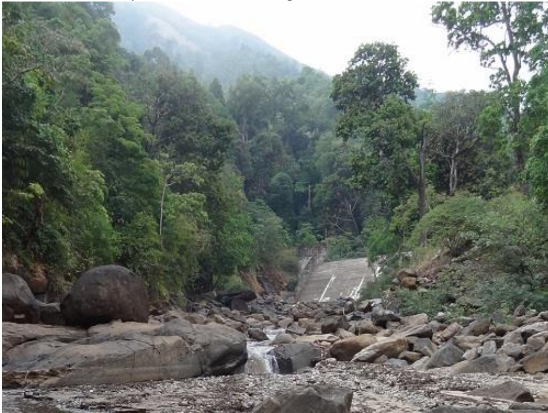
Dewatered stretch of river below a SHP weir