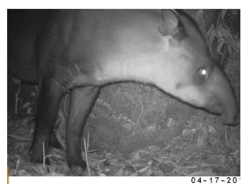
Image 2: Adult male registered in camera trap, with a great failure in the right ear, an excellent mark for the process of animal's individualization.