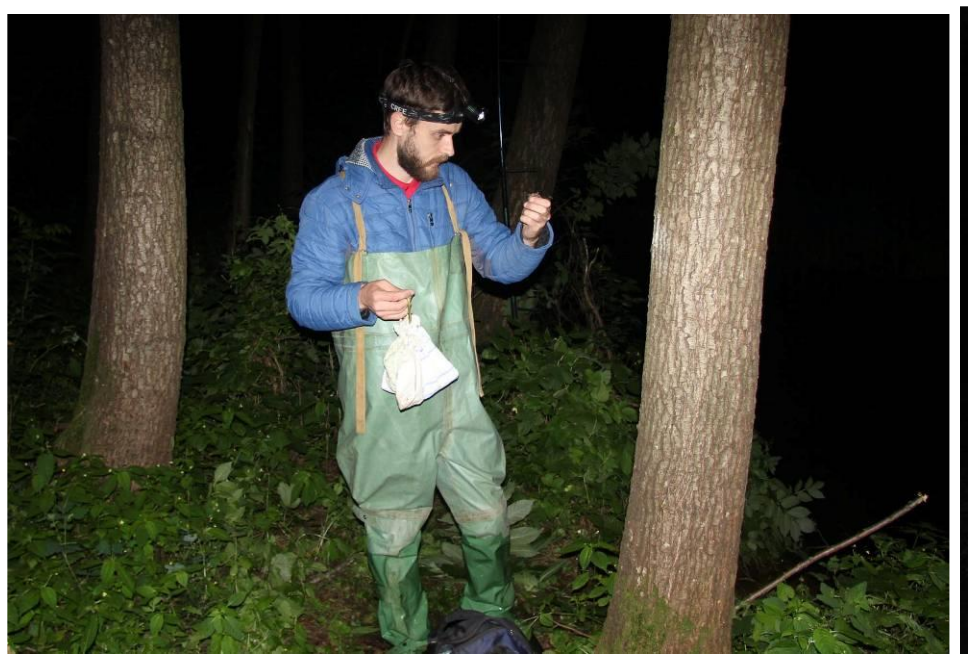
After a short examination bats were released in a place of catching.