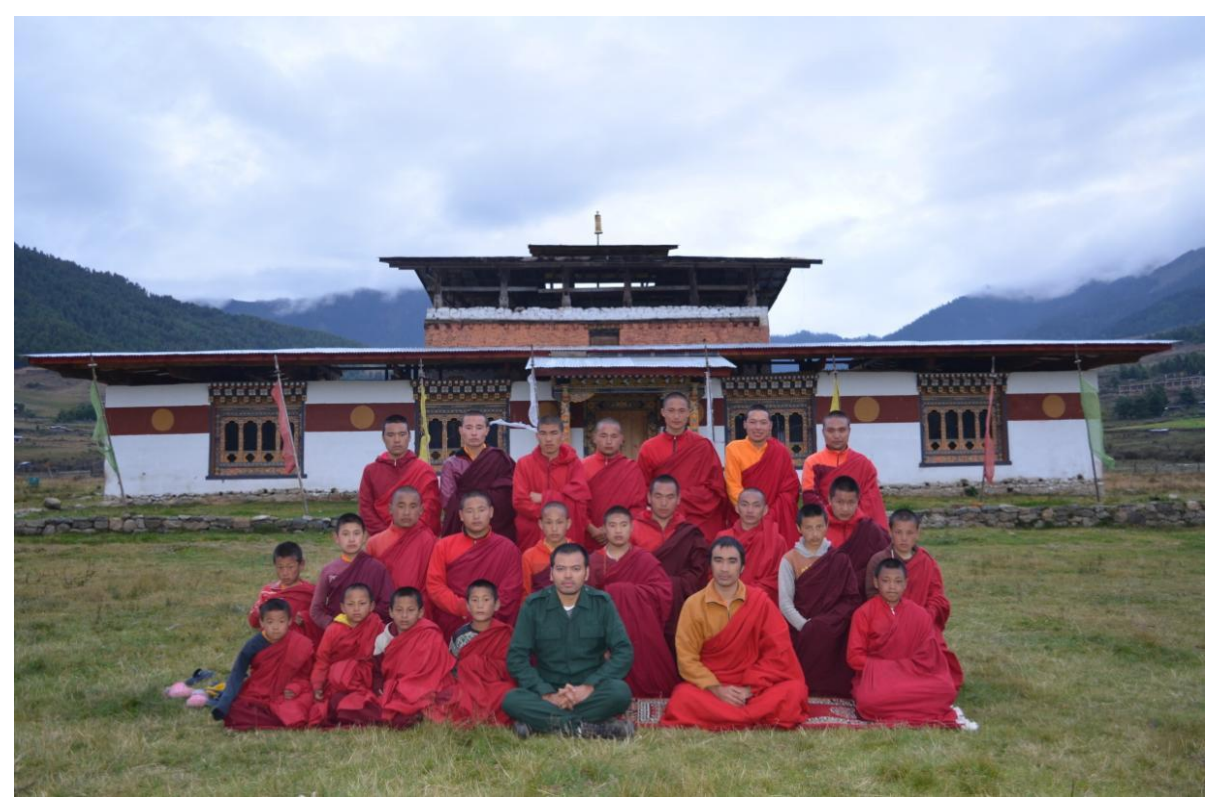
Figure 2. The monks of Khewang Lhakhang with the abbot after sensitisation workshop.