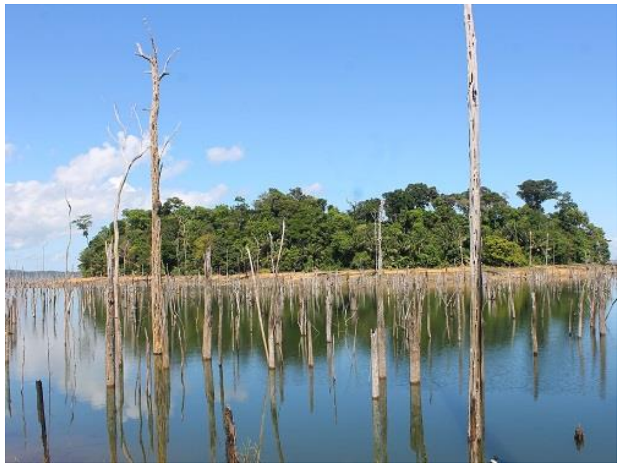
Photo1: Isolated forestal island surrounded by the "Cacaia" matrix (water with dead trees) inside the Balbina Dam reservoir.

We just come back from the first fieldwork expedition, which had a total of 31 days. In this fieldwork we sampled 19 islands and one mainland plot. We had some difficulty to reach some islands and the mainland plot because the water level of the Balbina Dam reservoir is considerably low and some of ours microphones did not work perfectly. But besides this, the bat sampling was successful in almost all plots. Now we started to analyse the sonograms and initially found around 10 bat species, besides some interesting feeding and social buzzes. The next step is to return to more 30 fieldwork days in 10<sup>th</sup> August 2016. Now we will sample the last islands and the two mainland plots that are lacking. In this way, we will complete the sampling in all the islands and mainland sampling points.