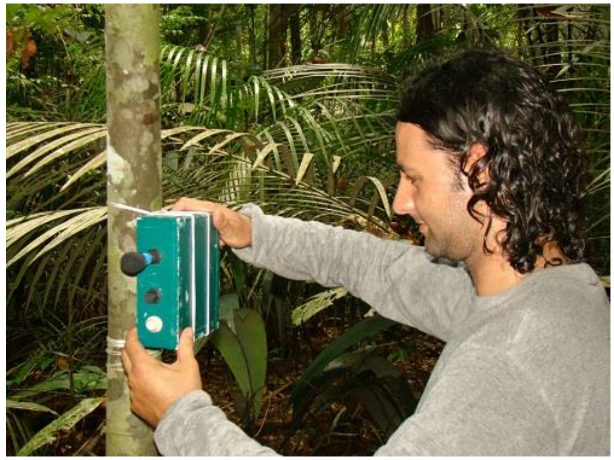
Photo2: Placing the autonomous ultrasound recorder in the sampling plot inside an island.