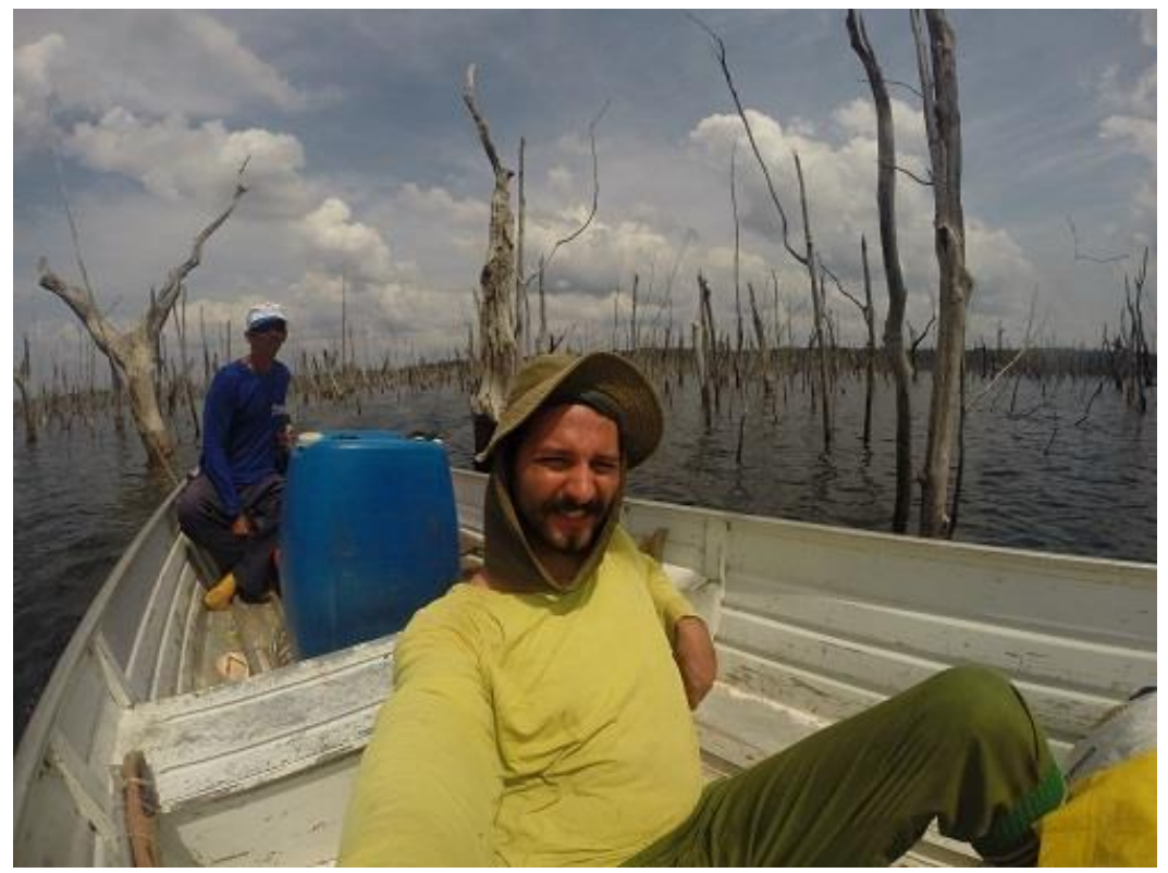
Equip returning to Balbina Village after the last fieldwork day from the dry season.

We are already planning the wet season fieldwork, which will start probably in the beginning of February 2017. Once now we have acquired large experience in the field, we hope to low down field time and costs in the wet season expedition.