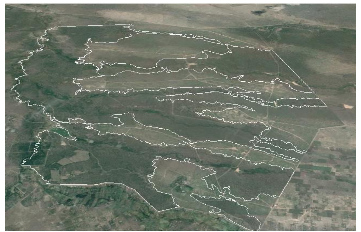
Eastern section of the Ol Pejeta Conservancy. Tracked polygons marked with thin whitish line shows areas under E. divinorum as of year 2016.

In order to understand various vegetation covers, reconnaissance study was undertaken which involved tracking of the areas under E. divinorum . Here, vegetation cover were described, their characteristics as well as mapping their locality. Tracking was undertaken using hand held Global Positioning System (GPS) by cruising at the peripherals of areas under E. divinorum . The tracked polygons were converted to readable formats in various Geographic Information Systems platforms. This was necessary for re-projection and map editing to over lay perfectly over the already existing shapes of the entire OI Pejeta Conservancy (OPC). The tracked polygons were used in collaboration with google earth satellite images for digitizing purposes. The google earth image below is part of the generated polygons covered by E. dvinorum .