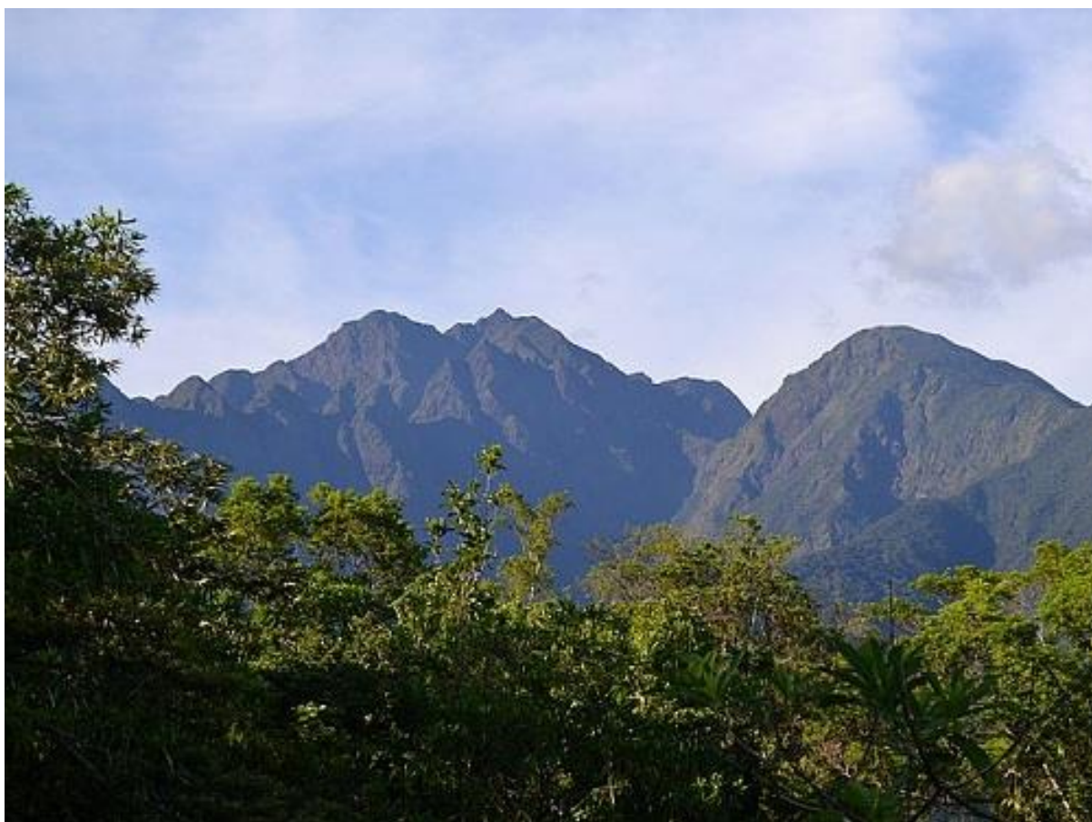
View of Mt. Guiting Guiting from the lowland buffer zone showing the rugged and steep peaks