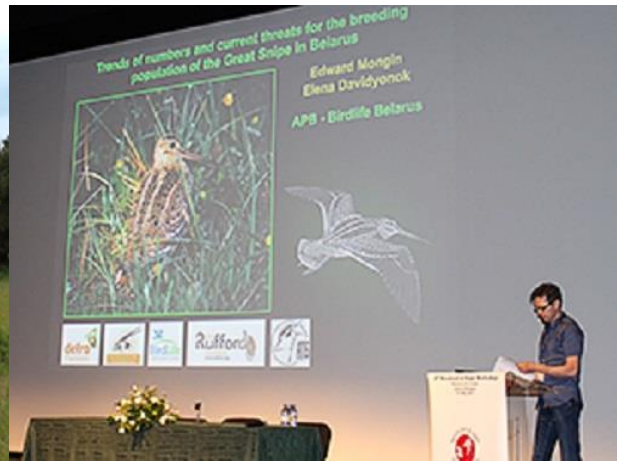
Left: Study of Great Snipe distribution on floodplain meadows during breeding season using radio-tracking in valley of the Berezina River. Right: Presentation of the project results at Eighth Woodcock & Snipe Workshop in the Portugal.