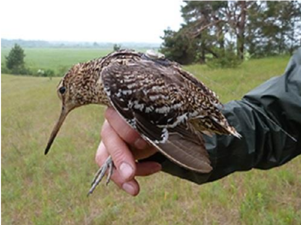
Caught Great Snipe female equipped with VHF transmitter.