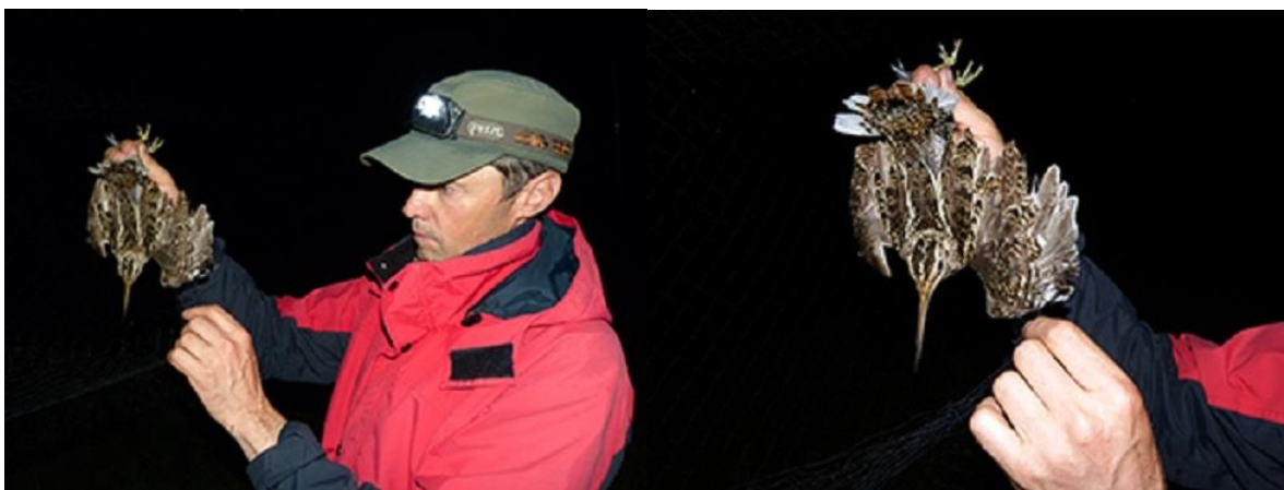
Capture of Great Snipes in a lek near the Berezina River.

We presented the project results at Eighth Woodcock & Snipe Workshop that was held in Portugal from 9th to 11th May, 2017. Data will be published in the conference proceedings by the end of this year.