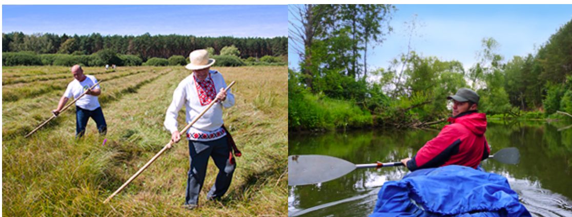
Left: Haymakers competed in the Sporovo fen mire. Right: Search of the Great Snipe leks in the Drut River floodplain using kayak.