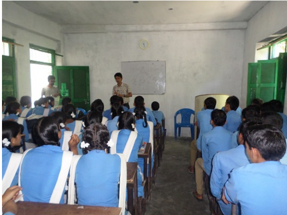
Himalayan Black bear conservation programme in Darchula, Nepal.

We have finished fieldwork from Humla, Darchula, Baitadi and Bajhang districts. During the field survey, we collected the scats of Himalayan black bear and vegetation of their habitats for diet and nutritional analysis. We also conducted the conservation awareness programmes in these districts. I started diet analysis work in lab. After completion of diet analysis work I will start nutritional analysis work in lab.