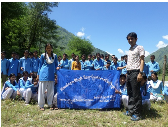
Himalayan Black bear conservation programme in Darchula, Nepal.