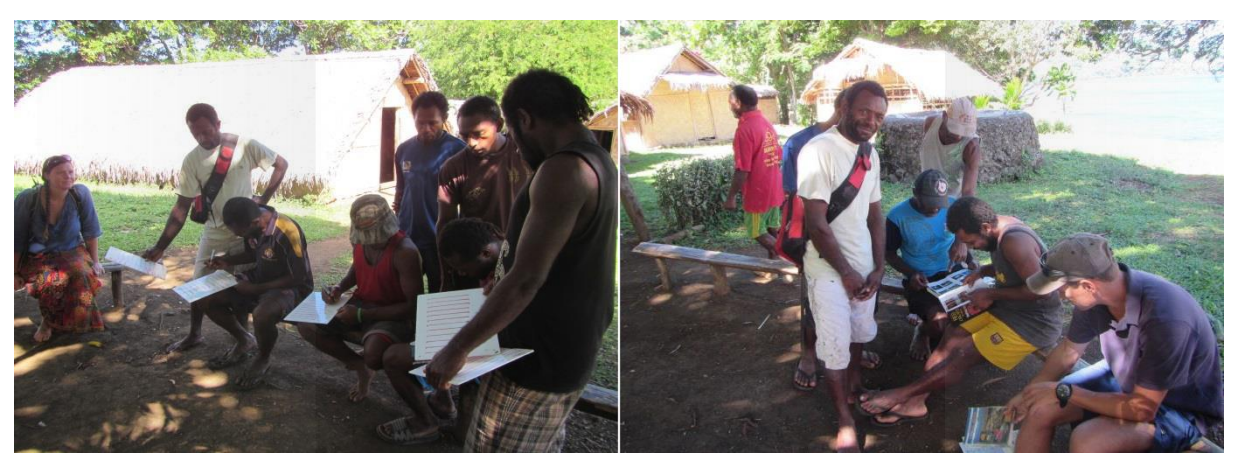
Figure 1: Monitors deciding on indicators to include in the surveys.

The conservation committee, which was established during previous visits by OceansWatch, were given refresher training on marine ecology and the Reef Guardian monitoring programme. After the training, which was delivered in Bislama, the Reef Guardians held a discussion using guidance given in the presentation on the types of indicators and factors that they thought were important to monitor (Figure 1).