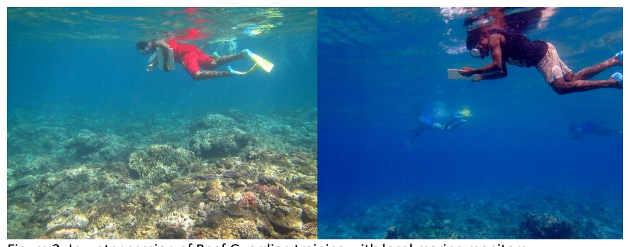
Figure 2: In water session of Reef Guardian training with local marine monitors

In the water sessions were held (Figure 2). Further sessions came following a request from the monitors in the first group who wanted to show marine monitors from a neighbouring village how to carry out the new monitoring method. This local interest was very encouraging as one of our goals was to build local capacity.