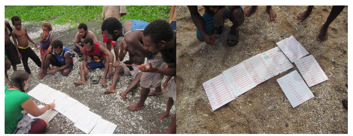
Figure 3: Marine monitors coming to a consensus on the beach

All Reef Guardians had an individual slate and recorded what they thought they saw and experienced when swimming along the survey line. Following this they came together on the beach to discuss their findings and came to a consensus on indicator species and reef health parameters they wanted to record (Figure 3).