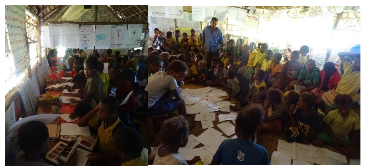
Figure 5: Children from Silver Memorial School drawing their marine organisms and placing their drawings into the food web

The main theme for this year's education sessions was how people are connected to their marine environment. All 80 children from the local school were involved. Food webs were the focus and the children participated in a variety of exercises that developed their understanding of energy transfer through the food web (Figure 5). We were able to deliver this within local cultural context.