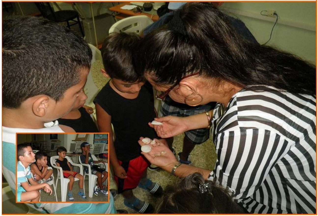
Figure 1. The environmental education activities in rural communities.