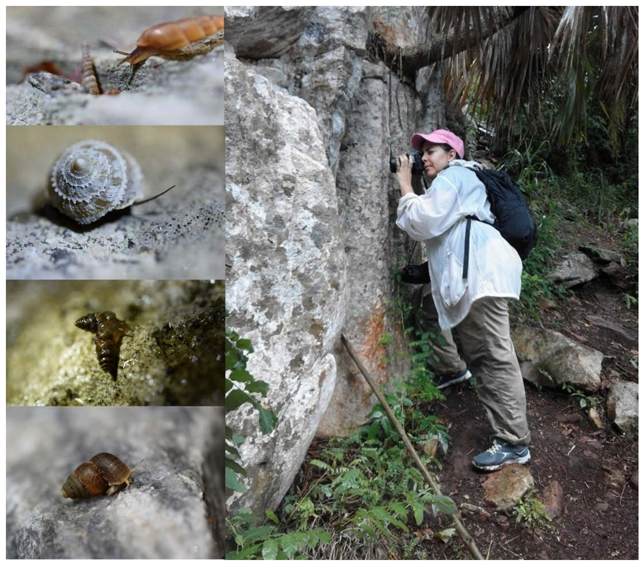
Figure 2. Field trips to Sierra de las Casas and Sierra Bibijagua, Isla de la Juventud, Cuba.