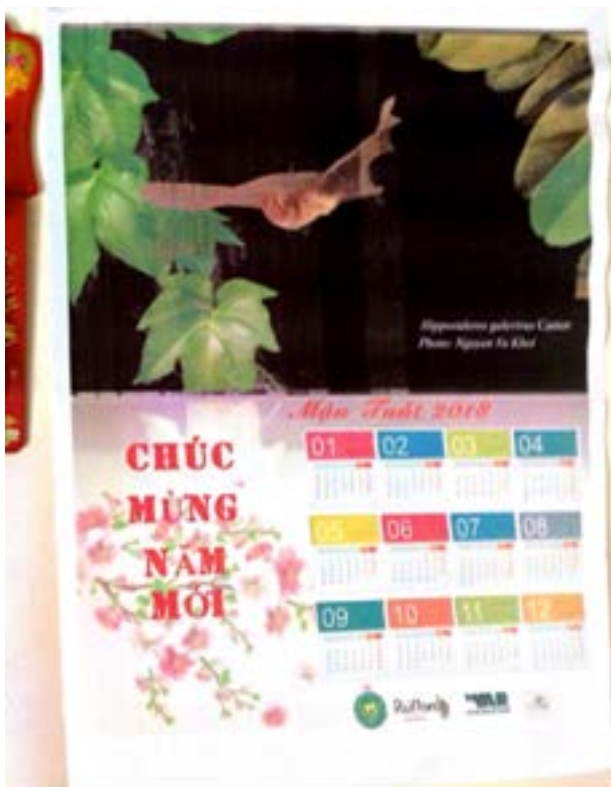
Poster - Calendar 2018