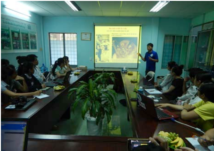
Workshop on "Urban bats and bat borne diseases" held in April 2017 at the University of Da Nang - University of Education (co-organised with GreenViet)

The project team also collaborated with local organizations (i.e GreenViet) to established seminars and workshops on "Urban bats and bat borne diseases".