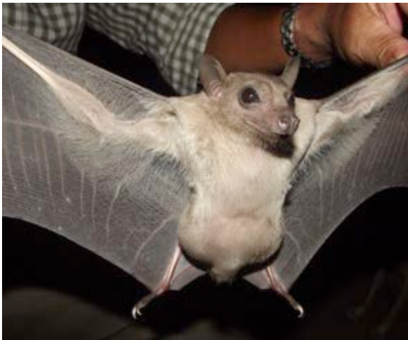
A pregnant Rousettus sp.

Some selected bats were captured during the field surveys of the project