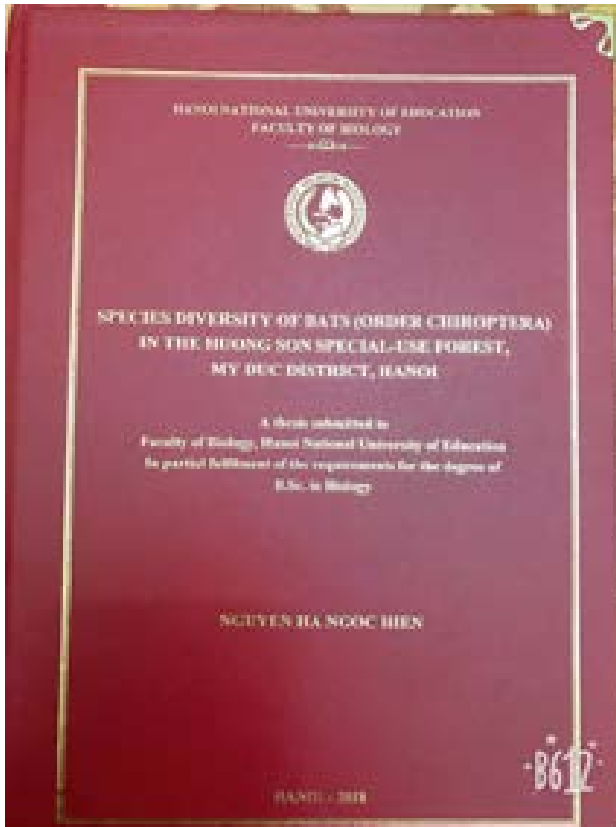
BSc thesis – N.H.N Hien

BSc thesis and awareness raising materials: