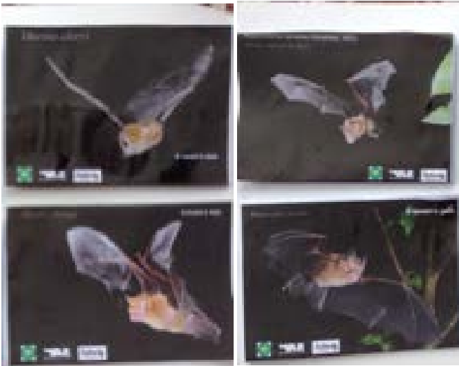
Stickers for kids

Some selected bats were captured during the field surveys of the project