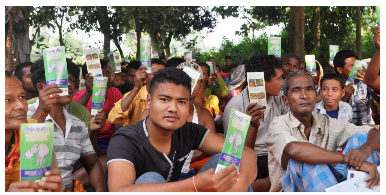
Participants holding poster after the training sessions.

A local radio station 'Radio Samgam FM' in Kolvi, Bara has been contracted to start radio-based early warning and awareness on human-elephant coexistence. This FM has started broadcasting the radio message from early November. The radio message has been broadcasted three to five times a day. During the training sessions, locals were also requested to provide information about the elephant movement in their area to the selected FM. With such information, people can take precautions when elephant is around and human casualties can be greatly reduced.