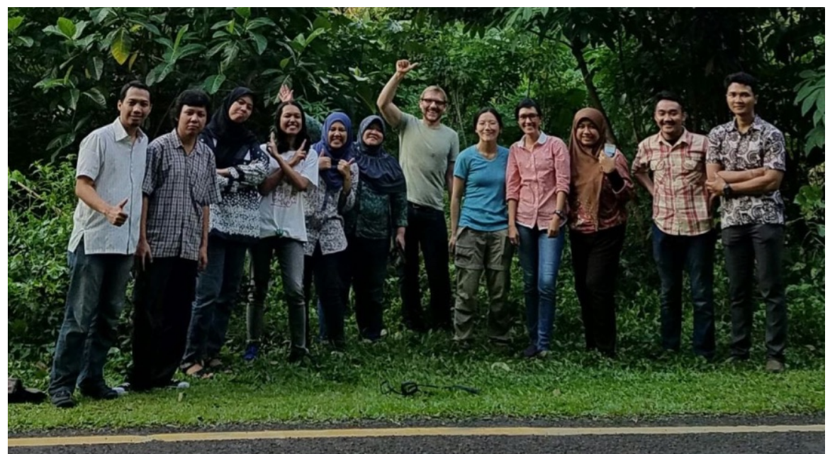
Figure 1. Photo of one group of students from University of Indonesia Batch 2 with workshop lecturers under one of the mistnets set up on campus.