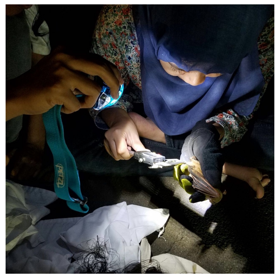
Figure 2. Students measuring bats in the field.