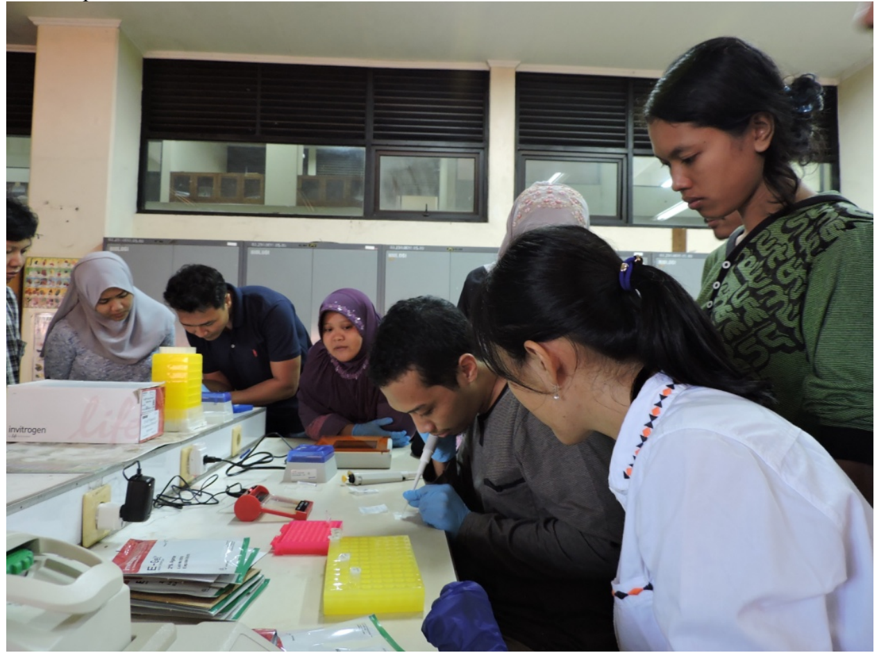
Figure 3. Students at work on different tasks in the laboratory portion of the workshop.

Students were able to successfully extract DNA, amplify the barcoding gene COI (cytochrome oxidase I), and visualize the DNA using gel electrophoresis. Students were provided with two datasets of bats to work on during the bioinformatics portion of the workshop, one of frugivorous Pteropus bats and one of insectivorous Myotis bats. Students were tasked with creating a phylogenetic tree using DNA Subway and then interpret what those relationships mean. We completed one set of analyses together as a whole group, and then divided students into pairs to complete the second dataset on their on their own. All students were able to complete this exercise in the classroom, and the post-assessment for this portion is still being conducted. We have maintained a Google Group for all the workshop groups in order to address questions that students may have regarding analyses and anything we have gone over during the workshop.